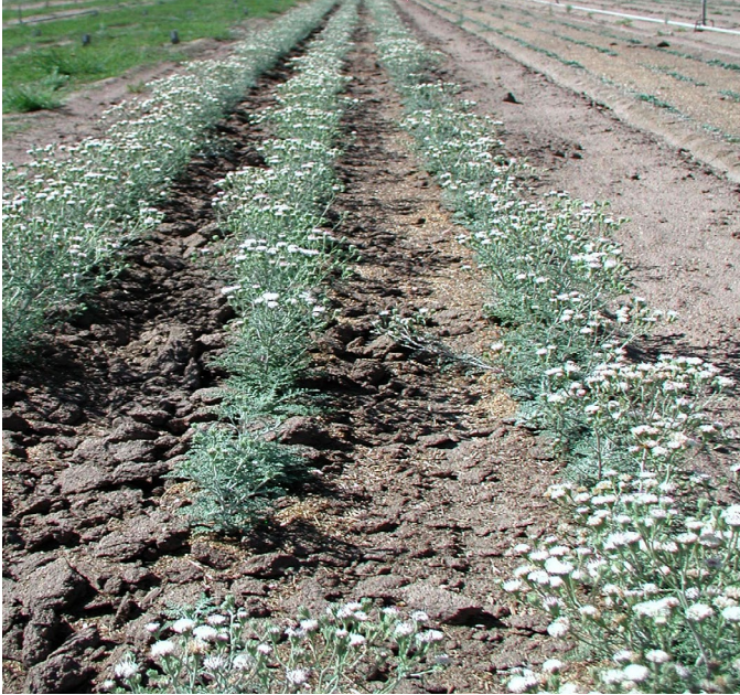
Figure 6. Douglas' dustymaiden seed production plot at the USFS Lucky Peak Nursey.

Program for native field certification for native plants, which tracks geographic origin, genetic purity, and isolation from field production through seed cleaning, testing, and labeling for commercial sales (Young et al. 2003; UCIA 2015). Growers should use certified seed (see Wildland Seed Certification section) and apply for certification of their production fields prior to planting. The systematic and sequential tracking through the certification process requires pre-planning, understanding state regulations and deadlines, and is most smoothly navigated by working closely with state regulators.