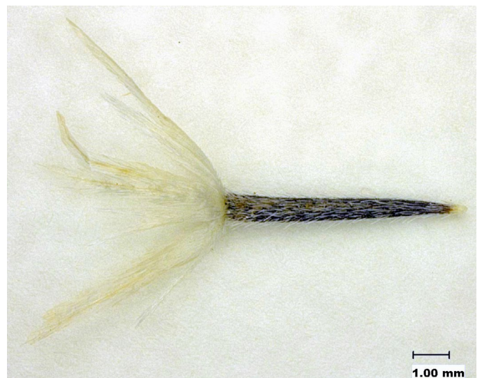
Figure 3. Douglas' dustymaiden achene with pappus.