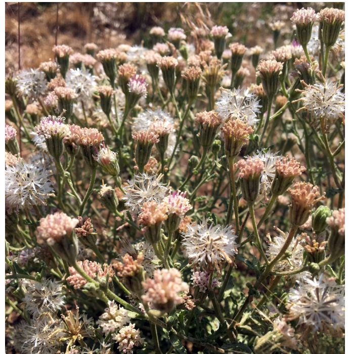
Figure 5. Uneven seed ripening is typical for Douglas' dustymaiden.

Estimates of seed maturation and fill to determine adequacy of sites for collection and collection timing can be made using a cut test or X-ray test. The 'pop test' described by Tilley et al. (2011) may be a useful predictor of seed fill (See Seed Testing section).