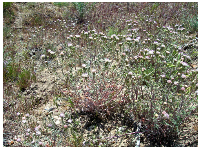
Figure 1. Douglas' dustymaiden in natural rangeland habitat.

Douglas' dustymaiden was common on silver mine dumps near Park City, Utah, visited about 45 years after the end of surface mining operations (Alvarez et al. 1974). It occurred on sites where average mid-July soil temperature averaged 62.2° F (16.8 °C) at 15 inches (38 cm) deep, phosphorous levels averaged 784 µg/300 cc of soil, and calcium levels averaged 376 mg/300 cc of soil. Density of the species increased significantly ( P = 0.01 ) with increasing soil phosphorus (Alvarez et al. 1974). On sulfide-bearing waste areas left from copper pit mining operations at the Bingham Canyon Mine in Utah, Douglas' dustymaiden occurred on both saline (0.06-0.5 dS/m) and low to neutral pH (4.2-7.9) soils (Borden and Black 2005).