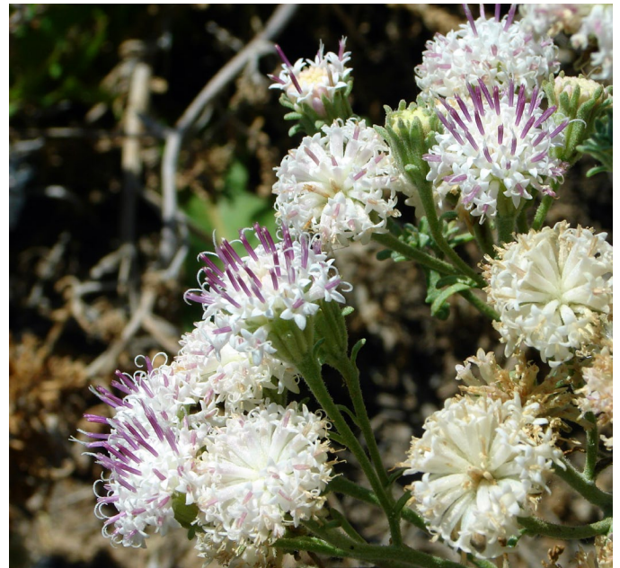
Figure 2. Douglas' dustymaiden flowers.

Flowering is indeterminate and occurs in the first year (Shock et al. 2014c). Flowers can be found anytime from April to September in the Intermountain West (Anderson and Holmgren 1976; Cronquist 1994; Parkinson and DeBolt 2005). Flowers in June and July are most typical (LBJWC 2017).