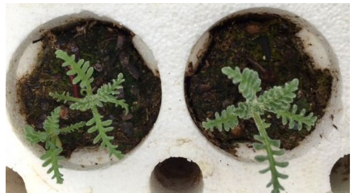
Figure 7. Container-grown Douglas' dustymaiden seedlings.

Container plants were produced in Boise, Idaho, by placing sown containers outside in December (DeBolt and Barrash 2013). Emergence began after 2 months and was complete after 4 months. Seedlings were transferred to 5.5-inch containers when secondary leaves developed. Seedlings were grown outside for 6 months, and when observed, flower stalks were removed to promote vegetative growth. Seedlings were outplanted in October.