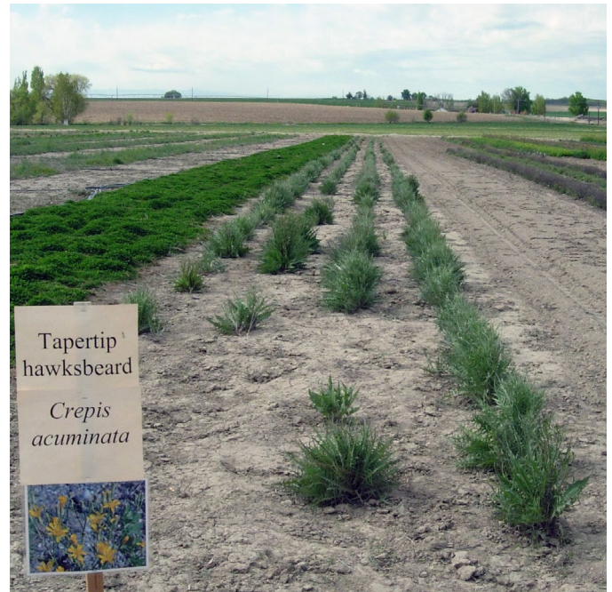
Figure 10. Tapertip hawksbeard growing in research plots at Oregon State University's Malheur Experiment Station in Ontario, OR.

Some initial investigations related to establishment and maintenance of tapertip hawksbeard stands for seed production have been made (Fig. 10).