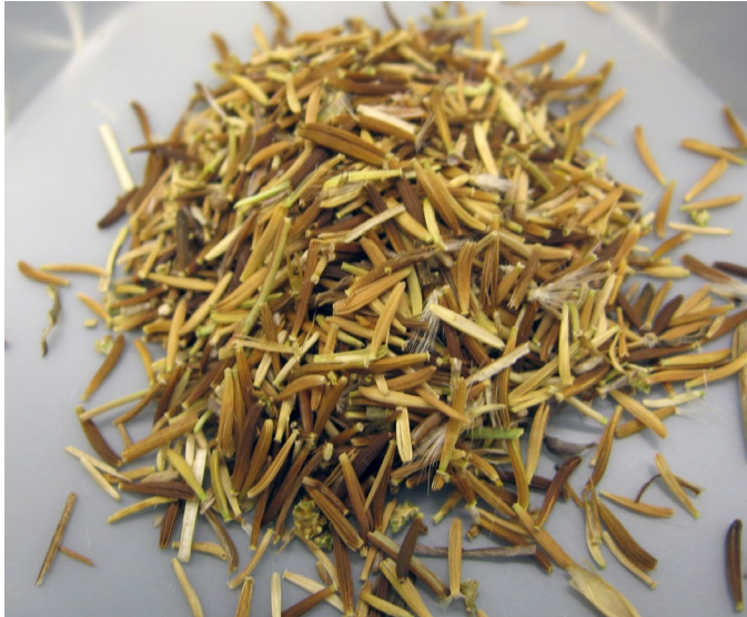
Figure 9. Cleaned tapertip hawksbeard seed.

Seed Cleaning. Tapertip hawksbeard seed can be cleaned of chaff and seed contaminants without any mechanical equipment, but if pappus removal is necessary, some mechanical processing is likely necessary (Fig. 9).