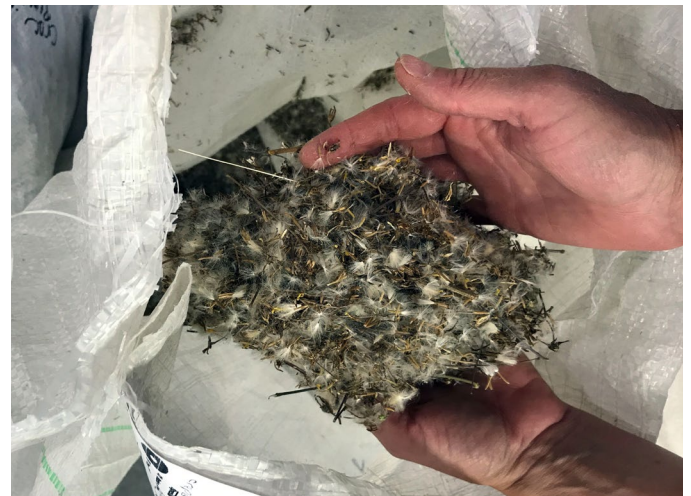
Figure 7. Uncleaned tapertip hawksbeard seed collected from wildland stands.

Wildland Seed Collection. Mature tapertip hawksbeard seed is available from mid-June through mid-July (Fig. 7). Presence of a fluffy white pappus is a good indication that seed is ripe. Harvesting seed before the pappus opens dramatically increases the amount of non-viable seed collected (Tilley et al. 2012). Because insect damage to seeds is common, evaluating the damage in potential collection areas can help to plan efforts for maximum seed yield. In wildland stands in central Utah, the percentage of insect-infested flower heads ranged from 0.9 to 80%, and the percentage of seed damage ranged from 0.7 to 22% depending on the site and year (Anderson 2009). Common seed predators included tephritid flies ( Campiglossa spp.) and snout moths ( Phycitodes albatella ) (Anderson 2009). In 2012 it was reported that wildland collections were not typically available from commercial sources, and contract collecting costs exceeded $100/lb (Tilley et al. 2012).