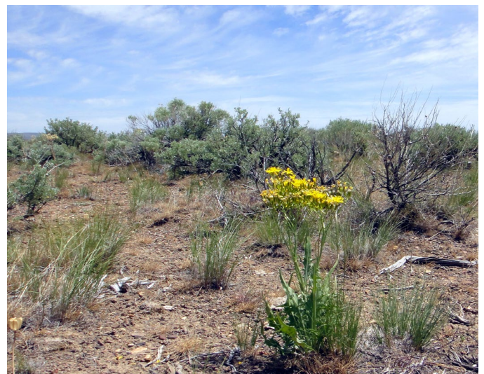
Figure 2. Tapertip hawksbeard growing in Oregon.

Shrublands. Tapertip hawksbeard is commonly associated with sagebrush (Fig. 2) and mountain brush communities. In a 10-year study of plant communities, soil, and vegetation relationships in near climax sagebrush communities in northern Utah, southern Idaho, northeastern Nevada, and west-central Wyoming, tapertip hawksbeard occurred in 47 of 85 sagebrush-grassland plots (Passey et al. 1982). In descriptions of rangeland cover types of the US, tapertip hawksbeard was described as frequent in basin big sagebrush ( Artemisia tridentata subsp. tridentata ), mountain big sagebrush ( A. t. subsp. vaseyana ), threetip sagebrush ( A. tripartita ), and more mesic parts of Wyoming big sagebrush ( A. t. subsp. wyomingensis ), and black sagebrush ( A. nova ) communities (Shiflet 1994). In the Blue and Ochoco mountains of Oregon, tapertip hawksbeard was frequent but cover was low in antelope bitterbrush/Idaho fescue-bluebunch wheatgrass ( Purshia tridentata / Festuca idahoensis - Pseudoroegneria spicata ) and mountain big sagebrush/Idaho fescue-prairie Junegrass ( Koeleria cristata ) communities (Johnson and Swanson 2005).