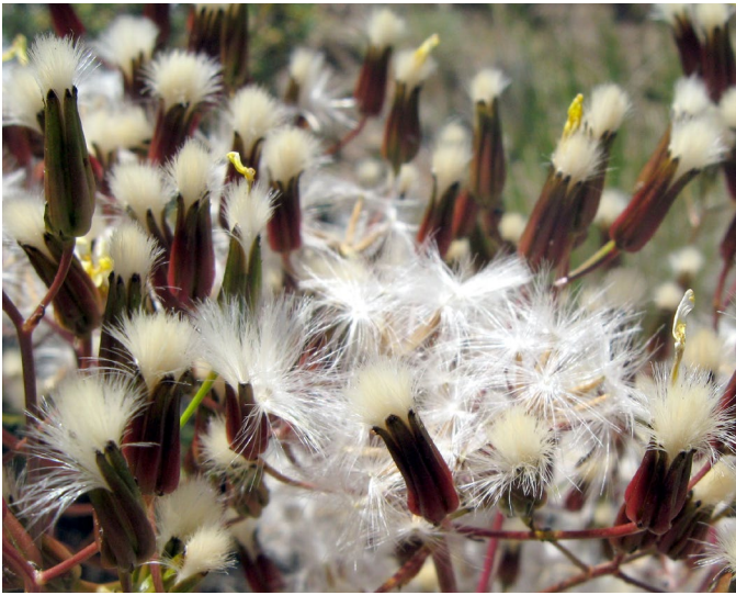
Figure 5. Open and closed tapertip hawksbeard seed heads.

9, and plants were dry on August 3. The variation in date range for these stages was 42 days for appearance of flower stalks, 40 days for first blooms, 43 days for full blooming, and 20 days for ripe seed (Blaisdell 1958).