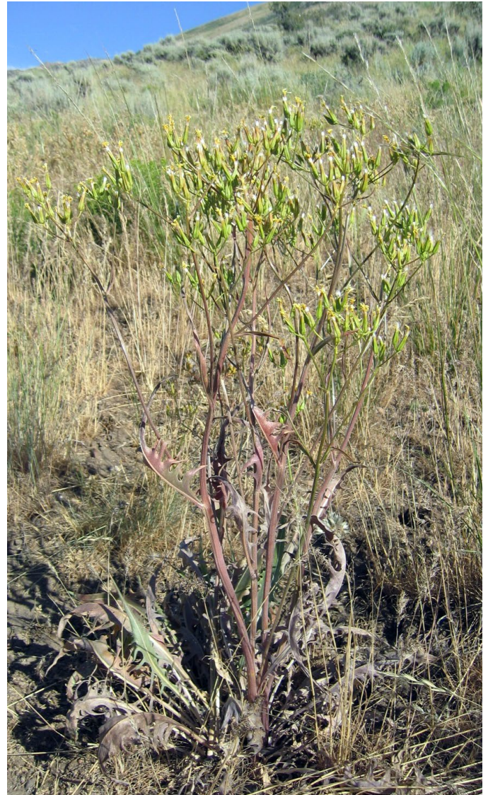
Figure 8. Tapertip hawksbeard producing seed heads in the Ruby Mountains of Nevada.

Because tapertip hawksbeard seeds are easily wind-dispersed, collecting seed heads early in the day or ripening process when heads are closed is an option (Fig. 8). However, Jensen (2004) found that viability of closed seed heads was 40% and of open seed heads was 61%. Comparisons of the collections were made on the same site on the same day.