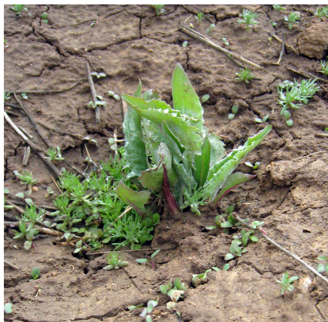
Figure 11. Tapertip hawksbeard transplant growing in research plots near Nephi, UT.

Fall seeding tapertip hawksbeard as part of a seeding mixture is recommended for fine sandy loams, silts, coarse-textured, or gravelly soils receiving at least 8 to 20 inches (200-500 mm) of precipitation (Walker and Shaw 2005; Vernon et al. 2007; Ogle et al. 2012; Tilley et al. 2012).