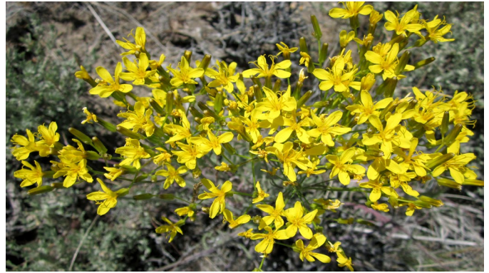
Figure 4. Tapertip hawksbeard inflorescences, note the indeterminate flowering.

Tapertip hawksbeard produces an abundance of flower heads (20-100 or more) (Fig. 4), which are arranged in compound corymbiform inflorescences (Munz and Keck 1973; Bogler 2006). Flower heads are narrow, erect, and made up of 5 to 12 petal-like, perfect, ray flowers with 5-toothed tips (USFS 1937; Babcock and Stebbins 1938; Hermann 1966; Anderson and Holmgren 1976; Welsh et al. 1987; LBJWC 2018). Flower heads are enclosed by conspicuous, smooth, equal bracts with a few very short outer bracts at the base (USFS 1937). Fruits are 6 to 9 mm long, nearly cylindrical cypselas (false achenes) with pointed tips and a white pappus with barbed bristles. Fruits are yellow, buff, or brown with 10 to 12 longitudinal ribs. Length of the ribs equals or exceeds pappus length (USFS 1937; Babcock and Stebbins 1938; Munz and Keck 1973; Cronquist et al. 1994; Bogler 2006). Tapertip hawksbeard fruits are cypselas, but they are often referred to as achenes or seeds because seeds are not removed from the fruits in the cleaning process. Throughout this review, the term seed will refer to the fruit or cypselas and the seed it contains.