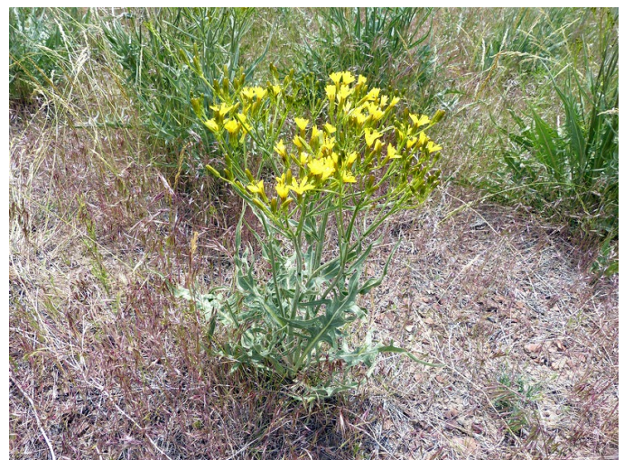
Figure 3. Tapertip hawksbeard growing in Nevada.

Revegetation guidelines recommend tapertip hawksbeard for fine silt loam, silt, and sandy to coarse-textured soils on sites receiving 8 to 20 inches (20-50 cm) of precipitation (Walker and Shaw 2005; Ogle et al. 2012). Recommendations for restoration are discussed in the Wildland Seeding and Planting section.