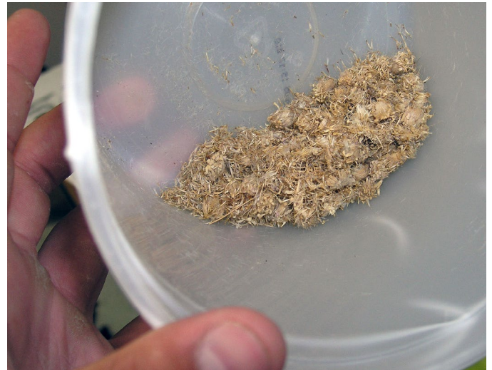
Figure 8. Desert yellow fleabane bulk seed collection.

Post-collection management. Although not specifically discussed in the literature, post-collection management of desert yellow fleabane seed likely requires attention similar to that of most wildland seed. Seed should be dried thoroughly before storing and if insects are suspected, insect strips can be used or seed can be stored at low temperatures to prevent substantial loss to insect damage.