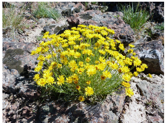
Figure 4. Desert yellow fleabane plant growing in a rocky site in Nevada.

Desert yellow fleabane is a perennial from a stout multi-branched taproot giving rise to a branched, woody caudex (Cronquist et al. 1994; Nesom 2006). Taproots typically reach a minimum depth of 12 inches (30 cm) (Mee et al. 2003). Branches of the caudex are covered in withered but persistent leaf bases, and plants exude a watery juice when injured (Welsh et al. 2016). Plants are strongly tufted, often with many erect stems mostly from 2 to 8 inches (5–20 cm) tall (Fig. 4) (Taylor 1992; Cronquist et al. 1994), but mat-forming plants have also been reported (Bates et al. 2007). Stems and leaves are sparsely to densely covered with fine, stiff, appressed hairs. Bases of the stems are hairless or nearly so, slightly enlarged, and straw to purple in color (Cronquist 1947; Munz and Keck 1973). Leaves are mostly basal but can be well distributed along the stems (Cronquist 1947; Nesom 2006). Leaf bases are enlarged and straw to purple in color (Cronquist 1947; Welsh et al. 2016). Hairiness of leaves is also similar to that of the stems with sparse to dense, stiff, fine, and short hairs all appressed in the same ascending direction (Munz and Keck 1973; Cronquist et al. 1994). Leaves are alternate, simple, entire, and linear from 0.4 to 3.5 inches (1–9 cm) long and 0.5 to 3 mm wide (Cronquist 1947; Munz and Keck 1973; Nesom 2006). If present, leaves along the stems are reduced (Mee et al. 2003).