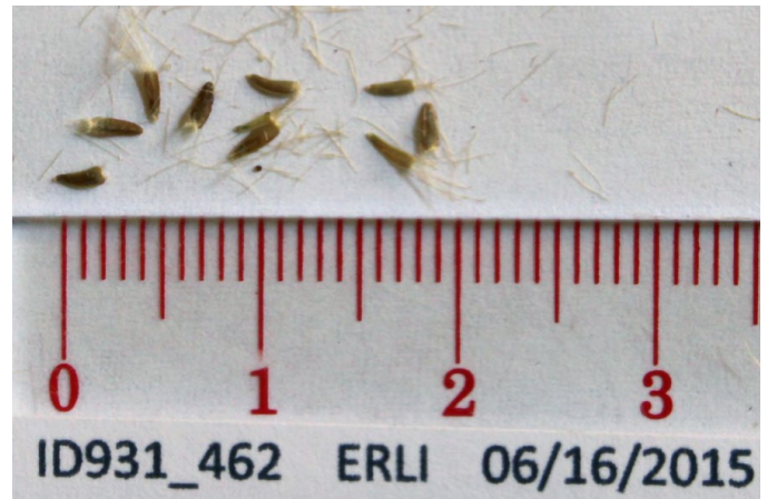
Figure 9. Desert yellow fleabane seed collected from plants in Idaho.

Marketing Standards. Acceptable seed purity, viability, and germination specifications vary with revegetation plans. Purity needs are highest for precision seeding equipment used in nurseries, while some rangeland seeding equipment handles less clean seed quite well.