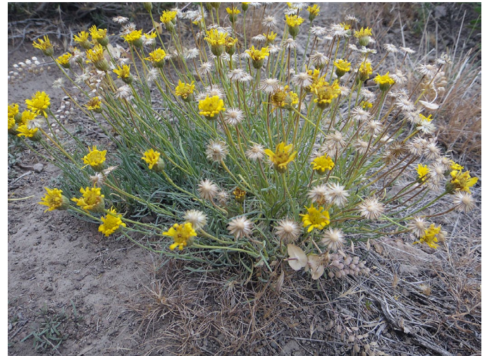
Figure 6. Indeterminate seed production of a desert yellow fleabane plant in Oregon.

Wildland Seed Collection. Details about wildland seed collection were limited in the literature, though some harvesting clues are provided in plant photographs taken by the USDI BLM Seeds of Success (SOS) field collection crews. Seed appears to be indeterminate (Fig. 6) suggesting that population monitoring and revisiting sites is necessary to maximize harvests.