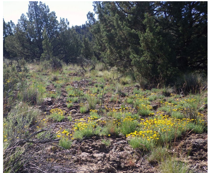
Figure 2. Desert yellow fleabane growing adjacent to a juniper community in Oregon.

Desert yellow fleabane often occurs in the western juniper ( J. occidentalis )/big sagebrush/bluebunch wheatgrass vegetation type which ranges from southeastern Washington south to northern California and eastern Idaho (Shiflet 1994) and is frequent in the northern part of the western juniper woodland zone of southern Washington and Oregon (Dealy 1990). In central Oregon, desert yellow fleabane occurs consistently (40-100% constant), but as a low cover (0.1-0.2%) component in the western juniper zone (Driscoll 1964).