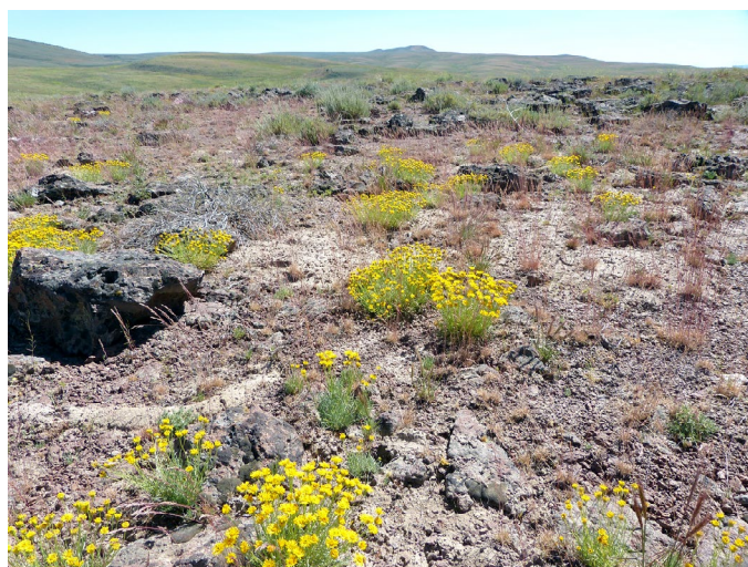
Figure 3. Desert yellow fleabane growing in a rocky site in Nevada.

Soils. Dry rocky or medium to coarse-textured soils (Fig. 3) with neutral pH are common in desert yellow fleabane habitats (Cronquist et al. 1994; Mee et al. 2003; Hitchcock and Cronquist 2018). Desert yellow fleabane is common in shallow, poorly developed soils with partially weathered rock fragments (lithosols) in sagebrush ecosystems, especially the western half of the sagebrush steppe and in basaltic areas of the Columbia Basin (Taylor 1992). Desert yellow fleabane dominated an overgrazed plot with an average soil depth of 2.25 inches (5.7 cm) in what was likely an antelope bitterbrush/Douglas' buckwheat ( Eriogonum douglasii ) potential vegetation type in the Blue Mountains of Oregon (Johnson and Swanson 2005). In central Oregon's western juniper zone, desert yellow fleabane had high constancy but low cover at sites with sandy loam to loamy coarse or clay loam soils with pH of 6 to 8 (Driscoll 1964).