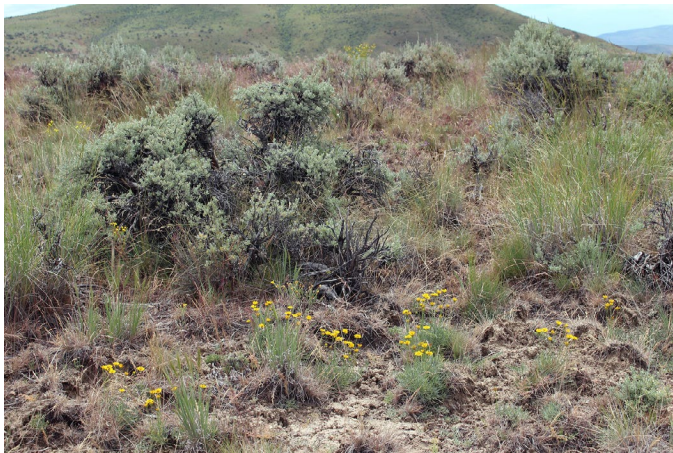
Figure 1. Desert yellow fleabane growing in a sagebrush grassland in Idaho.

Habitat and Plant Associations. Open rocky plains, foothills in low- to moderate elevation grasslands, shrublands (Fig. 1), and woodlands (Fig. 2) are common desert yellow fleabane habitat (Cronquist 1947; Mee et al. 2003; Nesom 2006; Pavek et al. 2012; Hitchcock and Cronquist 2018). Common vegetation associates include Idaho fescue ( Festuca idahoensis ), bluebunch wheatgrass ( Pseudoroegneria spicata ), sagebrush ( Artemisia spp.), rubber rabbitbrush ( Ericameria nauseosus ), bitterbrush ( Purshia spp.), and juniper ( Juniperus spp.) (Cronquist 1947; Nicholson et al. 1991; Nesom 2006; Welsh et al. 2016). Less common associates include ponderosa pine ( Pinus ponderosa ) and Douglas-fir ( Pseudotsuga menziesii ) (Lloyd et al. 1990; Nicholson et al. 1991).