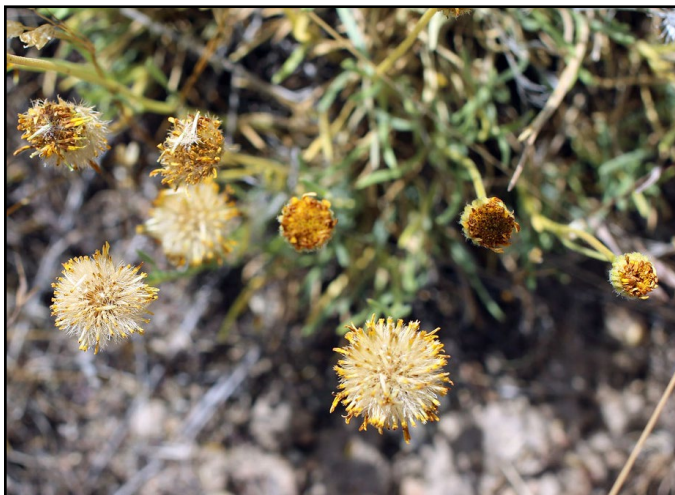
Figure 7. Desert yellow fleabane inflorescences with and without ripe seed.

Several collection guidelines and methods should be followed to maximize the genetic diversity of wildland collections: collect seed from a minimum of 50 randomly selected plants; collect from widely separated individuals throughout a population without favoring the most robust or avoiding small stature plants; and collect from all microsites including habitat edges (Basey et al. 2015). General collecting recommendations and guidelines are provided in online manuals (e.g. ENSCONET 2009; USDI BLM SOS 2016). As is the case with wildland collection of many forbs, care must be taken to avoid inadvertent collection of weedy species, particularly those that produce seeds similar in shape and size to those of desert yellow fleabane.