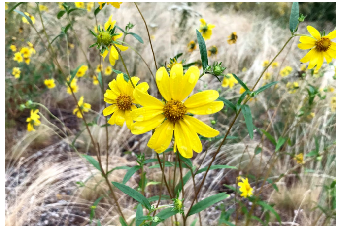
Figure 6. Showy goldeneye flowers on plants growing near Lowman, ID.

Horticulture. Showy goldeneye has considerable potential for use as a horticulture specimen plant (Hickman 1993). It produces abundant flowers (Fig. 6), is easily managed in landscape settings, and works well in mixed borders and meadow gardens. It is recommended for use in USDA Plants Hardiness Zones 4b to 10a (Tilley 2012).