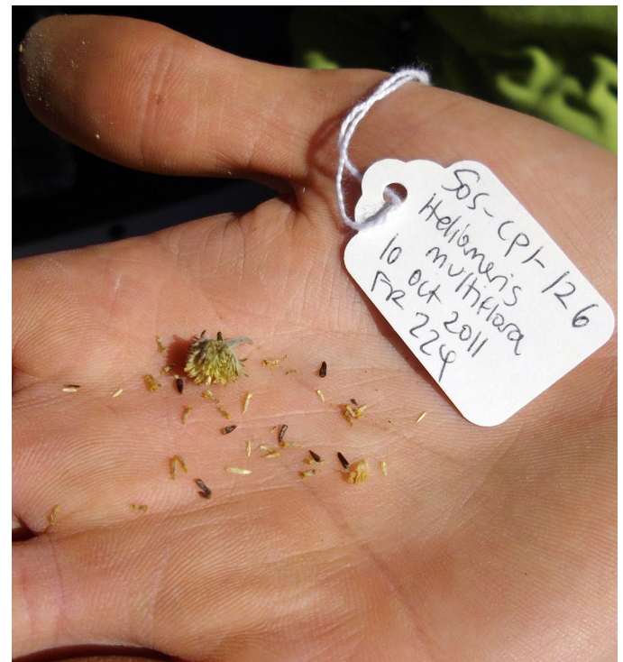
Figure 8. Showy goldeneye seed collected by BLM SOS on the Colorado Plateau.

Visual assessments of stands are useful to determine when seed is ripe. Harvests should occur when the majority of flowers have dry, yellow petals that have started to fall. At this time there will be a small number of fresh flowers, but most seed will be mature (Stevens et al. 1996).