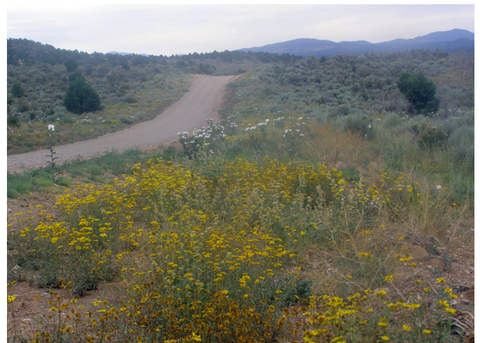
Figure 2. Heliomeris multiflora var. nevadensis in sagebrush along a roadside in Nevada.

Variety associations. Variety nevadensis is generally found in drier and lower elevation habitats than varieties multiflora and brevifolia , although there is overlap (Welsh et al. 1987; Cronquist 1994; Stevens and Monsen 2004a). Variety multiflora often occurs in sagebrush, pinyon-juniper and other woodland types, forests, and riparian sites. Variety nevadensis is also found in sagebrush and pinyon-juniper vegetation, but it is sometimes found in saltbush ( Atriplex spp.) and blackbrush ( Coleogyne ramosissima ) communities (Welsh et al. 1987; Cronquist 1994). In montane habitats, variety brevifolia is often found in shaded areas of canyons and woodlands; variety multiflora along roadsides, on rocky valley slopes, and in open woodlands; and variety nevadensis along roadsides and on dry, rocky slopes (Schilling 2006).