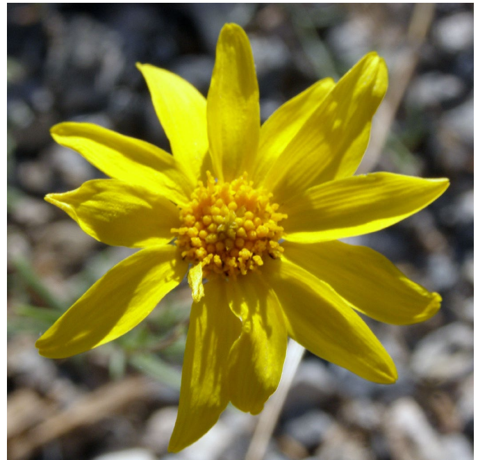
Figure 5. Flower of Heliomeris multiflora var. nevadensis growing in Nevada.

Reproduction. Showy goldeneye reproduces sexually from seed, which is produced by the perfect disk flowers (USDA FS 1937; Schilling 2006).