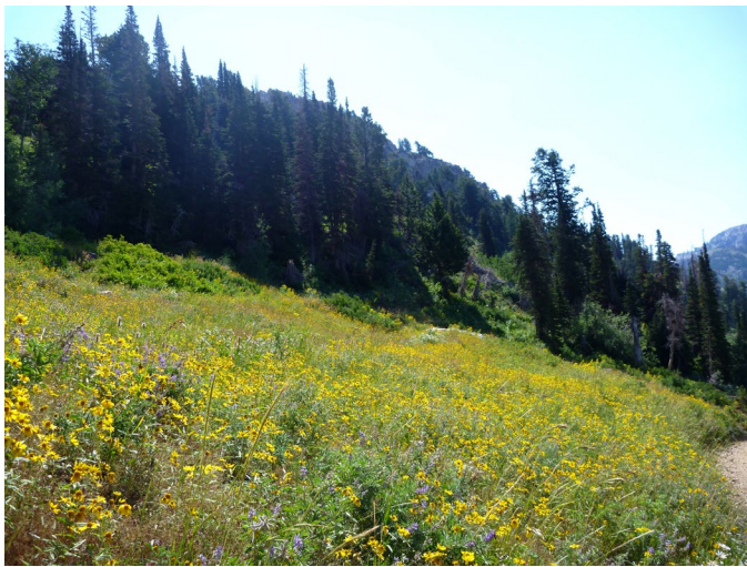
Figure 1. Showy goldeneye growing in a forest opening along a roadside in Utah.

Habitat and Plant Associations. Showy goldeneye is considered common over its range and locally abundant across a broad altitudinal range from valley grasslands to spruce ( Picea spp.) forests (USDA FS 1937). It is common along roadsides (Figs. 1 and 2) and on open, dry to moderately moist slopes receiving annual precipitation of 18 to 26 inches (450 to 650 mm) (Shaw 1958; Andersen and Holmgren 1976; Cronquist 1994; Tilley 2012). Showy goldeneye is common in basin big sagebrush ( Artemisia tridentata subsp. tridentata ), mountain big sagebrush ( A. t. subsp. vaseyana ), pinyon-juniper ( Pinus-Juniperus spp.), mountain brush, and quaking aspen ( Populus tremuloides ) communities (Shaw and Monsen 1983). It is also a common species in the tall forb rangeland type generally found at 6,300 to 9,000 feet (1,900-2,700 m) along streams, near springs, in forest openings, and in shrubland, woodland, and forest understories from the southern Wasatch range in Utah north to southern Montana (Shiflet 1994).