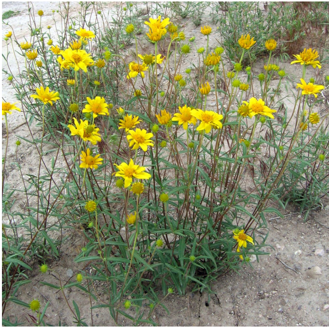
Figure 4. Heliomeris multiflora var. nevadensis growing in Utah.

inch (2.5 cm) long, and the petal is notched at the tip (Fig. 5). The central, disk-flower portion of the flower head becomes cone shaped with age (Shaw 1995; Schilling 2006). Showy goldeneye fruits are cypselas or false achenes, often referred to as achenes in the literature. The cypselas is smooth, black or gray striate, 1.2 to 3 mm long, and compressed longitudinally making it four angled. Cypselas do not have scales or pappi (USDA FS 1937; Welsh et al. 1987; Schilling 2006).