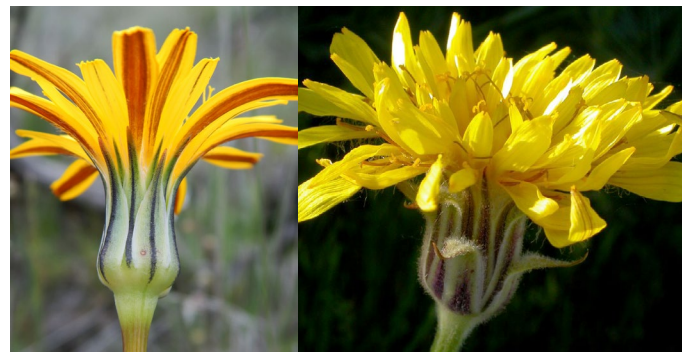
Figure 2. Sagebrush false dandelion flower heads with involucre bracts and ligulate ray florets.

Inflorescences (Fig. 2) are erect heads of 13 to 90 ligulate ray florets borne singly on each peduncle (Chambers 1993). Flower heads are each subtended by an involucre 0.6 to 1 inch (15-25 mm) wide consisting of 8 to 25 subequal, linear to lanceolate bracts (phyllaries) with the outer series shorter than or equal to the inner (Chambers 1993). The bracts are acuminate at the tip, green, sometimes with purple dots, and glabrous to white-hairy, especially on the margins and midrib, which is often purple (Cronquist 1955; Chambers 1993, 2006). The florets exceed the bracts. Ligules are yellow, sometimes with an orange midrib that may become pinkish with age. Florets may close early in the day during hot weather (Taylor 1992; Chambers 1993).