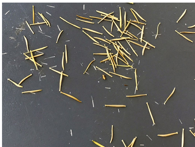
Figure 6. Sagebrush false dandelion seed after initial cleaning (above) and seed following final cleaning (below) at the USFS Bend Seed Extractory.

Wildland Seed Yield and Quality. The cleanout ratio (clean seed weight:rough weight of seed collection) for seed lots of sagebrush false