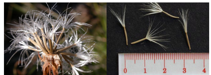
Figure 5. Mature fruits (cypselas, false achenes) of sagebrush false dandelion with pappus bristles. Note the lack of beaks on the fruits.

Post-collection management. Molding can occur if leaves and stems, which contain milky juice, are collected along with the seeds, particularly if collected during high humidity periods. Vegetative material should be removed promptly by hand or with sieves. Harvested seed should be spread on racks in a protected area and thoroughly air dried in the field or following transport to the cleaning facility. Collected material can be transported in clean, breathable bags or boxes and should be protected from overheating during transport. Insect infestations should be controlled by freezing collections for 48 hours or use of appropriate chemicals.