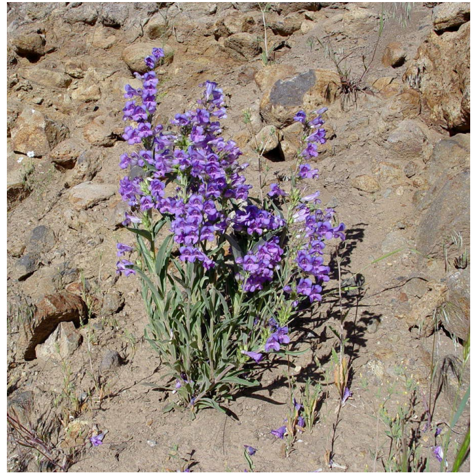
Figure 1. Royal penstemon plant in southeastern Oregon.

clasping, and folded lengthwise or flat (Cronquist et al. 1984; Hickman 1993). Leaves and stems may be purplish tinted. The inflorescence is an elongate, one-sided thyrse, an inflorescence with an indeterminate main axis and determinate subaxes (Fig. 1). There are sometimes thyrsoid branches from the lower nodes (Cronquist et al. 1984; Hickman 1993). Flowers are produced in 4 to 12 closely-spaced verticillasters (false whorls) along the inflorescence (Strickler 1997).