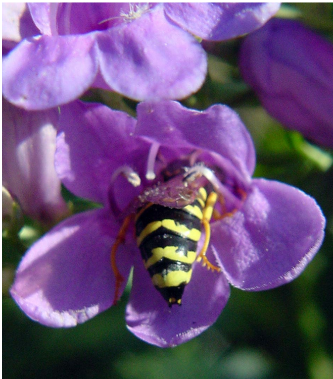
Figure 5. Royal penstemon visited by a solitary pollen wasp.

Pollination. Cane and Love (2016) inventoried pollinator abundance and diversity at native forbs used in restoration to estimate their “pollinator friendliness.” Surveys were conducted at four Nevada sites in sagebrush steppe and its ecotones with pinyon-juniper woodlands. Solitary native bees of the genus Osmia (Mason bees) comprised half of the observed pollinators at royal penstemon (Cane and Love 2016), while the solitary pollen wasp ( Pseudomasaris vespoides ), which may sleep in the flowers at night (Nold 1999), accounted for 19.8% of the observed pollinators (Fig. 5). The remaining pollinators included the bee genera Anthophora (digger bees, 2.7%), Bombus (bumblebees, 8.1%), Ceratina (small carpenter bees, 0.9%), Halictus (sweat bees, 11.7%), Hoplitis (Mason bees, 1.8%) and Lasioglossum (sweat bees, 3.6%). Two Mason bees ( Osmia brevis and O. penstemonis ) and the solitary pollen wasp were pollen specialists