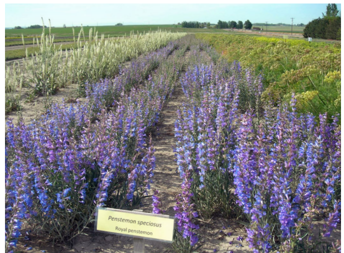
Figure 8. Royal penstemon irrigation test plots at OSU MES, Ontario, Oregon.

In 2013 establishment was improved ( P < 0.05 ) relative to the control (0.1% stand) only by combinations that included row cover and seed treatment. The addition of sawdust or sand did not result in further significant increases. The range for these treatments was 27 to 33.1% (Shock et al. 2014). In April 2014, only the combination of row cover, seed treatment, sawdust and sand (12.2% stand) improved stand compared to the control (0.7% stand) ( P < 0.05 ) for plots planted in fall 2013 (Shock et al. 2015a).