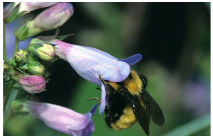
Figure 10. Royal penstemon flower pollinated by a bumblebee ( Bombus spp.).

Irrigation. Subsurface drip Irrigation requirements for royal penstemon were examined at OSU MES using subsurface drip irrigation (Shock et al. 2015b). This system provides precise application of water directly to the root system and away from crown tissues. This minimizes water use and reduces water availability to weed seeds. Drip lines were placed 12 inches (30 cm) deep between alternate rows (30-inch [76-cm] row spacing). Zero, 4, or 8 inches (0, 100, 200 mm) of supplemental water was added in four equal applications at 2-week intervals beginning with flowering. From 2006 to 2015, irrigation began between April 19 and May 20 ( \bar{x} = May 5) and ended between June 3 and June 5 ( \bar{x} = June 18). Seed yield of royal penstemon demonstrated a quadratic response to irrigation with the maximum response with 5 inches (130 mm) of irrigation. Irrigation of 4 to 8 inches (100–200 mm) supplemental water was recommended for warm, dry years, and none for cool, wet years (Shock et al. 2016).