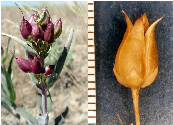
Figure 2. Royal penstemon with immature capsules (left) and mature capsule (right; scale in mm).

The fruit is a capsule, 0.2 to 0.6 inch (0.6-1.5 cm) long that opens apically. It becomes dry and parchment colored at maturity (Fig. 2). Seeds are brown, 2 to 2.5 (3.5) mm long, somewhat elongate and three-angled (Fig. 3; Cronquist et al. 1984; Hickman 1993; Hurd n.d). The embryo is slightly curved and embedded in living endosperm (Fig. 4; Hurd n.d.). Seeds are gravity dispersed.