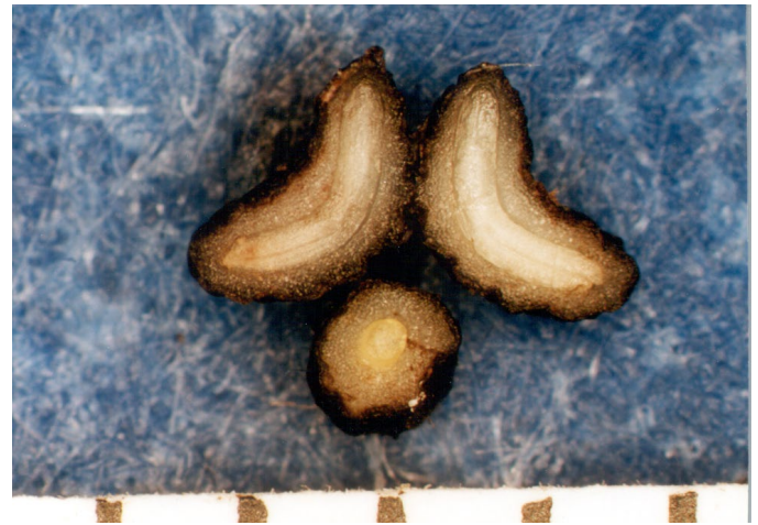
Figure 4. Royal penstemon seed: cross section and longitudinal sections. The embryo is surrounded by endosperm and the seed coat. Scale in mm.

Reproduction. Royal penstemon reproduces entirely from seed.