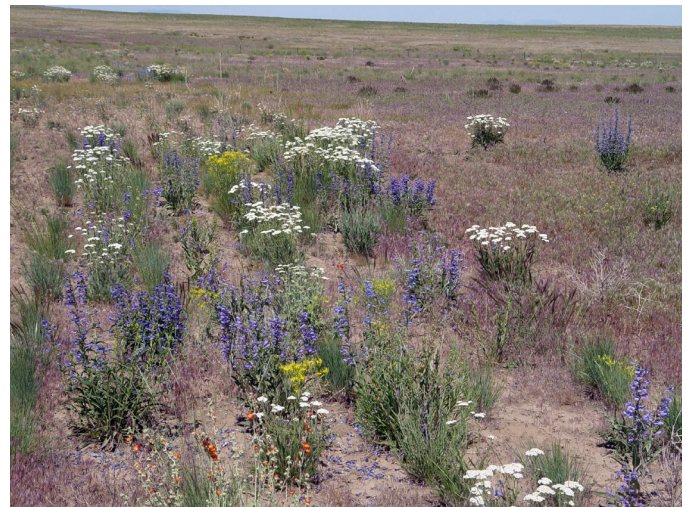
Figure 11. Royal penstemon in a post-fire study plot in southern Idaho.

Because of the low competitive ability of royal penstemon with cheatgrass (Parkinson 2008, Parkinson et al. 2013), it should be seeded in areas where cheatgrass seed density has been reduced by wildfire or other treatments and is not expected to recover rapidly (Ott et al. 2016b). To avoid competition with more rapidly growing seeded grasses and forbs having similar root morphologies, royal penstemon should be seeded in separate rows or areas, either alone or with other slow growing species with different rooting habits (Fig. 11; Parkinson 2008). This would reduce spatial overlap and interspecific competition for resources while increasing the diversity of species and life forms. Cane et al. (2007) suggested that royal penstemon pollinators Osmia brevis and O. penstemonis may have shallow underground nests, in which case they and the surface nesting Pseudomasaris vespoides would be susceptible to soil heating by wildfires (Cane and Neff 2011) or soil disturbance resulting from mechanical site preparation practices. Loss of specialist pollinators would restrict seeding of royal penstemon to areas near native vegetation that are likely to harbor the pollinators (Cane and Love 2016).