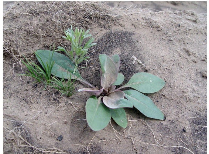
Figure 12. Royal penstemon seedling emerging from a post-fire seeding in southern Idaho.

be planted in spots prepared to limit competition. Initial watering may be required for planted seedlings if the soil is dry.