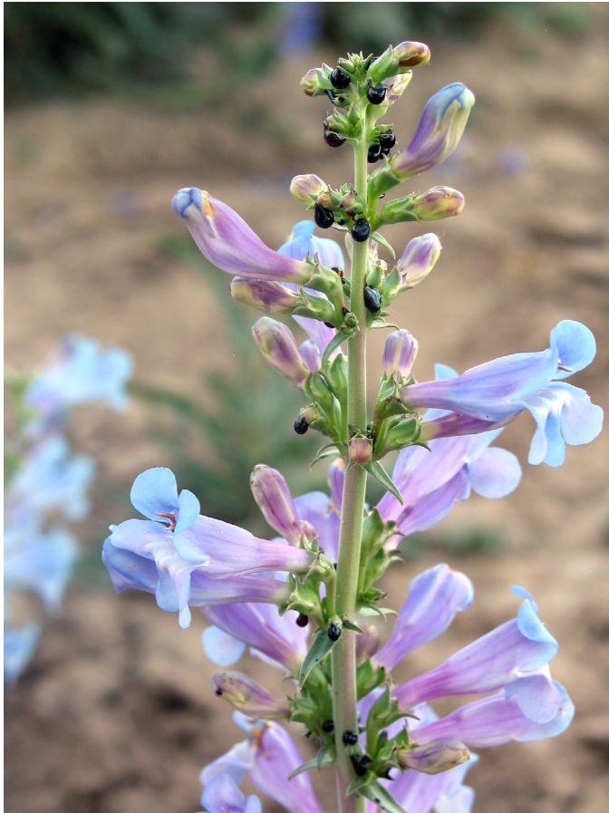
Figure 9. Royal penstemon “tears” (arrow). These are black tar-like drops produced near flower buds following lygus bug predation.

peak flowering for royal penstemon. Prolonged infestation and low seed set resulted from an early hatch in 2007 that was not adequately controlled by the insecticide treatment (Aza-Direct® [ai.: azadirachtin] at 0.0062 lb ai./ha, applied in May). Capture at 0.1 lb/acre and Orthene at 8 oz/acre (a contact and residual systemic) were applied during flowering or pre-flowering in subsequent years to control lygus bugs (Shock et al. 2016).