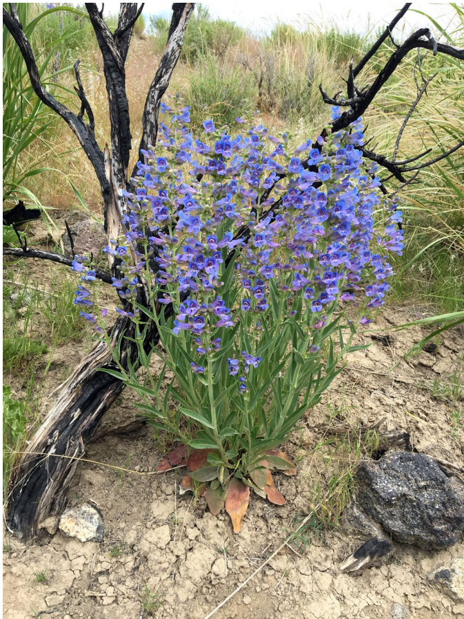
Figure 6. Royal penstemon one year after wildfire.

experienced under a snow pack followed by 4 weeks of incubation at 50 to 68 °F (10-20 °C) in light increased germination to 70%. Germination increased to 90% with 24 weeks of prechilling (Meyer and Kitchen 1994).