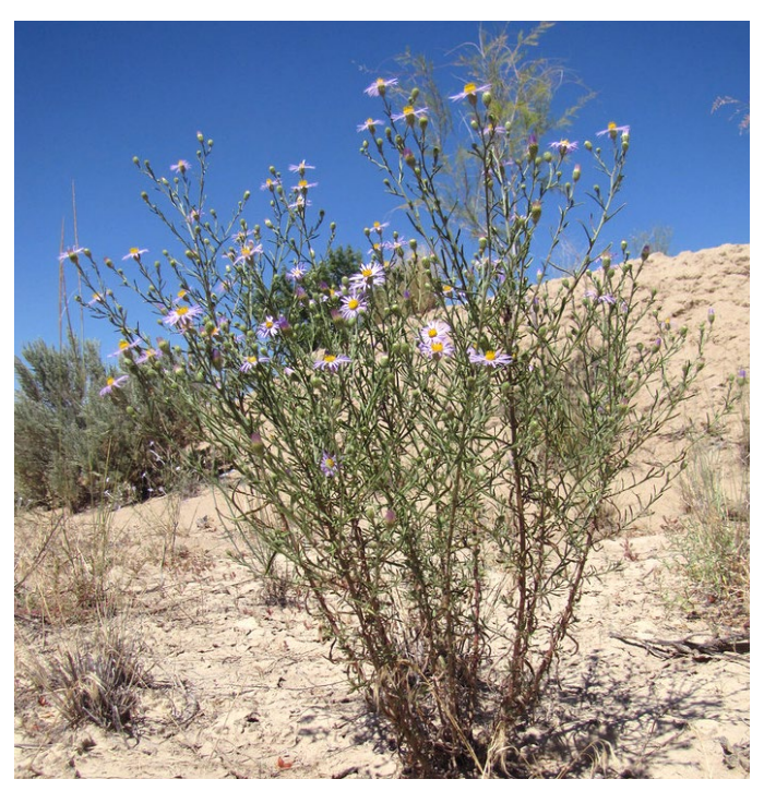
Figure 1. Hoary tansyaster growing in New Mexico.

Plants growing along roadsides in central New Mexico produced an average of 121 flower heads per plant (range: 29-260). Heads averaged 32 ray flowers (range: 26-38) and 66 disk flowers (range: 54-80) (Parker and Root 1981).