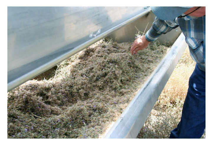
Figure 10. Hoary tansyaster harvested using a standard Flail-Vac and containing significant amounts of vegetative material.

Seed Harvesting. Seed can be harvested by hand, vacuuming, combining, or by swathing and windrowing plants (Fig. 10). The method used will depend on resources, desire for multiple harvests, and/or minimizing plant damage (Tilley et al. 2014). Seed matures 4 to 5 weeks after flowering and is typically harvested in late summer or fall (DeBolt and Parkinson 2005; Tilley et al. 2014; Shock et al. 2017b) depending on variety and location. In seed fields at IPMC, plants began flowering in late summer and continued flowering for several weeks into the fall. Only hand harvesting and vacuum harvesters allowed for multiple non-destructive harvests (Tilley et al. 2014). In seed production fields at OSU MES, the earliest flowering date was August 13 and latest flowering date was October 10 in 4 years of observations (Shock et al. 2017b).