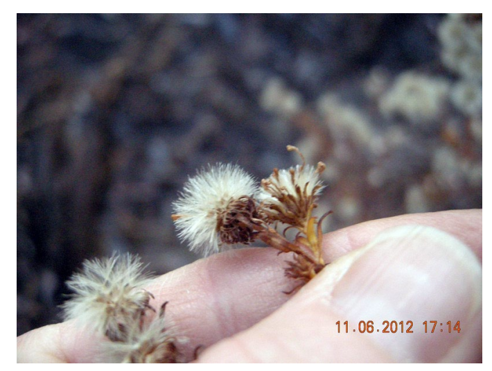
Figure 8. Collected hoary tansyaster seed heads.

Several collection guidelines and methods should be followed to maximize the genetic diversity of wildland collections: collect seed from a minimum of 50 randomly selected plants; collect from widely separated individuals throughout a population without favoring the most robust or avoiding small stature plants; and collect from all microsites including habitat edges (Basey et al. 2015). General collecting recommendations and guidelines are also presented in available manuals (e.g., USDI BLM SOS 2016; ENSCONET 2018).