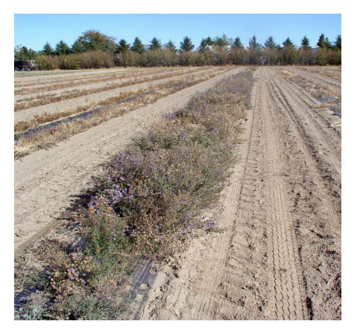
Figure 9. Hoary tansyaster seed production at the USDA NRCS Aberdeen Plant Materials Center in southern Idaho.

Agricultural Seed Certification. It is essential to maintain and track the genetic identity and purity of native seed produced in seed fields. Tracking is done through seed certification processes and procedures. State seed certification offices administer the Pre-Variety Germplasm (PVG) Program for native field certification for native plants, which tracks geographic origin, genetic purity, and isolation from field production through seed cleaning, testing, and labeling for commercial sales (Young et al. 2003; UCIA 2015). Growers should use certified seed (see Wildland Seed Certification section) and apply for certification of their production fields prior to planting. The systematic and sequential tracking through the certification process requires pre-planning, understanding state regulations and deadlines, and is most smoothly navigated by working closely with state regulators.