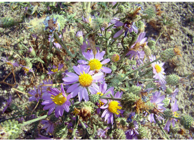
Figure 4. Hoary tansyaster displaying indeterminate flowering in Idaho.