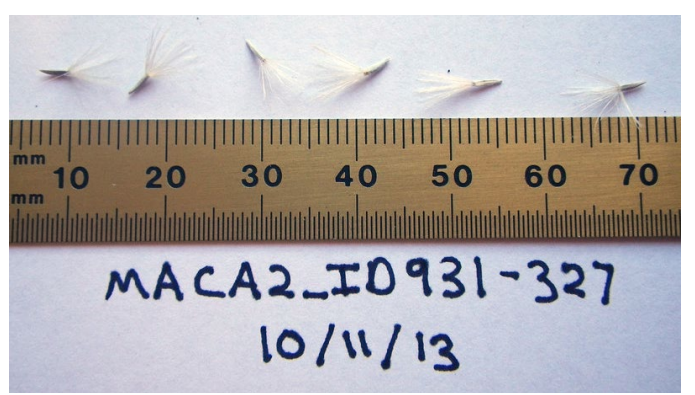
Figure 3. Hoary tansyaster seed collected from plants in Idaho.

Seed Production. Hoary tansyaster flowers in its first year. Flowering is indeterminate, and the first flowers appear in summer or fall depending on the variety and site conditions (Fig. 4) (Shaw et al. 2012; Tilley 2015b). There is a high degree of overlap in the timing of flowering among varieties. However, varieties incana and leucanthemifolia are generally earliest, producing flowers in June. Flowers are commonly found into September for all varieties, and many produce flowers into October. Variety canescens can be found flowering into November (Morgan 2006).