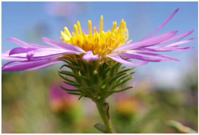
Figure 2. Lower heads on hoary tansyaster plants contain 8 to 25 purple-blue to white ray flowers and 10 or more yellow disk flowers.

Reproduction. Hoary tansyaster reproduces entirely from seed. Asexual reproduction does not occur.