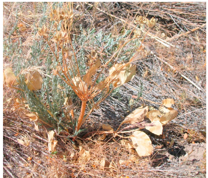
Figure 6. Barestem biscuitroot with mature schizocarps.

Seeds were also a highly valued medicine of the southern Kwakiutl Indians of British Columbia. Carbuncles were treated with chewed barestem biscuitroot seeds, which were covered with warm American skunkcabbage ( Lysichiton americanus ). Headaches were treated by having someone chew seeds and blow on the forehead. Chewed seeds were also applied to aches in the stomach, back, breasts, knees, or any body part. Seeds were eaten to cure constipation and sucked on to ease coughs and sore throats. Barestem biscuitroot was used with twinberry honeysuckle ( Lonicera involucrata ) and tobacco ( Nicotiana spp.) in a steam bath for general sickness, and this water was drunk by pregnant woman to insure an easy delivery (Turner and Bell 1973).