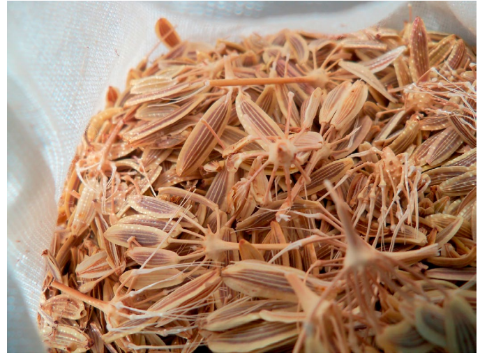
Figure 7. Barestem biscuitroot seed collection with many schizocarps and detached umbellets.

Developing a seed supply begins with seed collection from native stands (Fig 7). Collection sites are determined by current or projected revegetation requirements and goals. Production of nursery stock requires less seed than large-scale seeding operations, which may require establishment of agricultural seed production fields. Regardless of the size and complexity of any revegetation effort, seed certification is essential for tracking seed origin from collection through use (UCIA 2015).