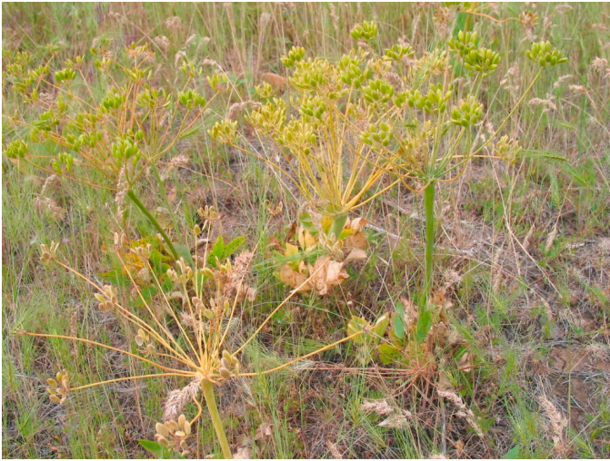
Figure 5. Barestem biscuitroot with fruits (schizocarps).

Breeding system and pollination. Barestem biscuitroot produces male and bisexual flowers. The bisexual flowers develop female parts before male parts. Flowers are primarily pollinated by bees, but because there is an overlap in the timing of sexual function between and within umbels, self-pollination is possible (Schlessman 1982; Cruden 1988). Fruit set for flowers freely visited by pollinators was 60 times that of flowers protected from pollinators for other Lomatium species (Cane et al. 2020).