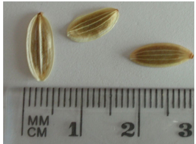
Figure 10. Barestem biscuitroot mericarps of about 1 cm long and 0.5 cm wide.

IN) with a 24 round top screen, 8 round bottom screen, medium speed, and low to medium air (Barner 2009).