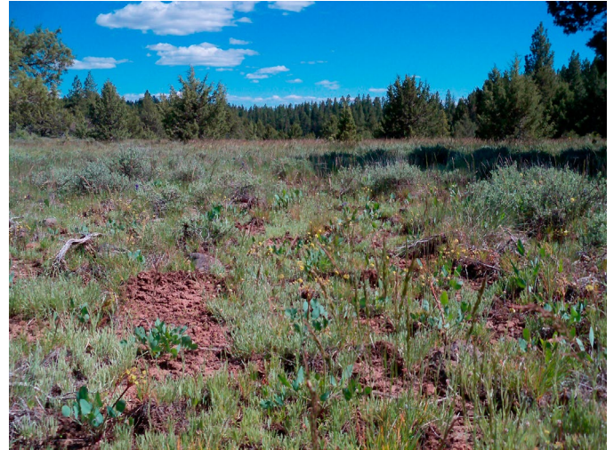
Figure 2. Barestem biscuitroot growing in an opening in a pinyon-juniper woodland in Oregon.

pinyon-juniper ( Pinus-Juniperus spp.) woodlands and pine forests (Fig. 2) (Hermann 1966; Munz and Keck 1973; Hickman 1993; Welsh et al. 2016; Hitchcock and Cronquist 2018). It is also common in Oregon white oak ( Quercus garryana ) woodlands and prairies in Oregon, Washington, and British Columbia (Pfeifer-Meister and Bridgham 2007; Marsico and Hellmann 2009). It was dominant in white oak remnant prairies at Mt. Pisgah southeast of Eugene, Oregon (Pfeifer-Meister and Bridgham 2007).