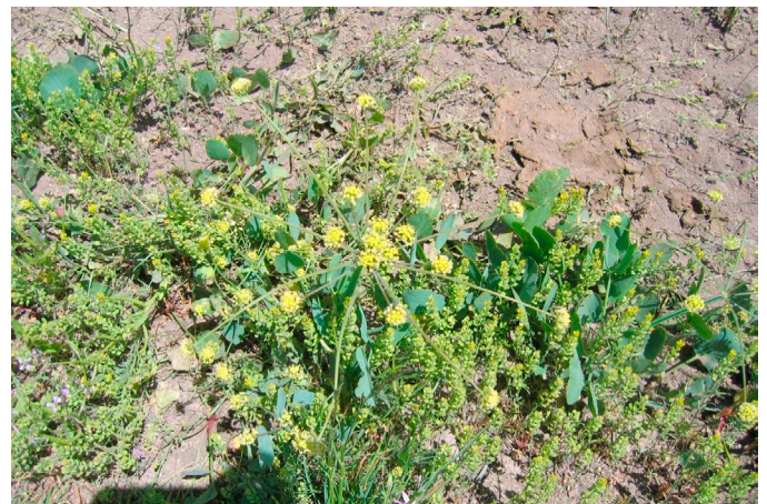
Figure 4. Barestem biscuitroot's compound umbels and tiny yellow flower clusters.

Flowers are produced in compound umbels (Fig. 4) at the ends of the tallest and stoutest flowering stems (USDA FS 1937; Lesica 2012). Umbels have 7 to 27 rays measuring 2 to 8 inches (6-20 cm) long sit atop swollen peduncles without bracts (USDA FS 1937; Hitchcock et al. 1961; Munz and Keck 1973; Blackwell 2006; Welsh et al. 2016). Rays terminate in secondary umbellets with a whorl of leafy bracts and clusters of tiny 5-petaled, yellow flowers (USDA FS 1937; Hickman 1993; Blackwell 2006; Hitchcock and Cronquist 2018). Longer outer rays generally support bisexual flowers, and shorter inner rays support primarily male flowers (Hitchcock and Cronquist 2018). Bisexual flowers produce slender, often curved or coiled styles (1-2 mm long) (Welsh et al. 2016). Fruits are schizocarps (Fig. 5) that contain two seeds (mericarps) (Welsh et al. 2016). Schizocarps are oblong, strongly flattened, 0.4 to 0.6 inch (1-1.4 cm) long, and 2 to 5 mm wide, with thin wings (USDA FS 1937; Welsh et al. 2016). The lateral wings (~0.5 mm) are narrower than the seed body. Mericarps have dorsal equal, threadlike ribs with one to several oil tubes per rib interval (USDA FS 1937; Hickman 1993; Welsh et al. 2016).