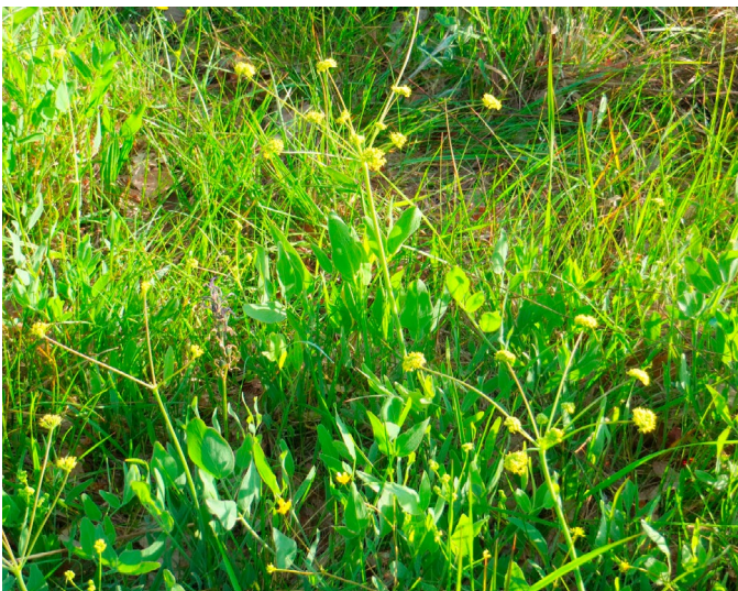
Figure 3. Barestem biscuitroot plants with petiolate pinnate leaves and oval leaflets.

Barestem biscuitroot is a glabrous perennial from a long, thick taproot (Hickman 1993; Welsh et al. 2016). At 4 to 8 years old, taproots can exceed 12 inches (30 cm) in length and are about 1 inch (2.5 cm) thick. Older plant roots growing in very sandy soils may be 3 feet (1 m) long and 6 inches (15 cm) wide (Drum 2006). Plants produce stout blue-green stalks up to 28 inches (70 cm) tall with swollen bases just below the inflorescences (Hermann 1966; Blackwell 2006). Plants in California reach greater heights (up to 28 inches [70 cm]) (Munz and Keck 1973; Hickman 1993) than those in Utah (up to 18 inches [45 cm]) (Welsh et al. 2016). Leaves are entirely or chiefly basal and rarely persistent (Hermann 1966; Welsh et al. 2016). Barestem biscuitroot produces pinnately (ternate or biternate) compound leaves with 3 to 30 distinct leaflets (Fig. 3) (Welsh et al. 2016; Hitchcock and Cronquist 2018). Leaves are petiolate and may have a dilated sheath. Petioles are up to 2.4 inches (6 cm) long for plants in Utah (Welsh et al. 2016) and up to 10 inches (25 cm) long for plants in California (Hickman 1993). Leaflets are oval to almost round, up to 2 inches (5 cm) wide, and nearly equal or up to 3 times as wide as they are long (USDA FS 1937; Taylor 1992; Welsh et al. 2016). Leaflets are often prominently veined with entire margins or with coarse teeth near the blunt tips (Hitchcock and Cronquist 2018).