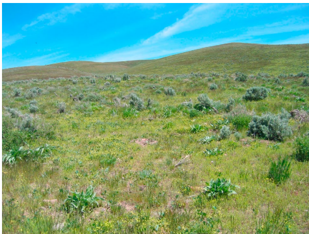
Figure 1. Barestem biscuitroot (scattered yellow flowers) growing in a sagebrush grassland.

Sagebrush ( Artemisia spp.) and mountain shrublands are also common barestem biscuitroot habitats (Munz and Keck 1973; Blackwell 2006; Welsh et al. 2016). Barestem biscuitroot grows throughout the sagebrush steppe except for its eastern extremes (Taylor 1992). Cover of barestem biscuitroot exceeds 5% in threetip sagebrush/Sandberg bluegrass-onespike danthonia ( A. tripartita / P. sandbergii - Danthonia unispicata ) communities at 5,170 feet (1,580 m) in the southern Blue Mountains of Oregon (Johnson and Swanson 2005). In eastern Oregon, eastern Washington, and extreme western Idaho, barestem biscuitroot is part of the sparse forb layer in the scabland sagebrush ( A. rigida ) rangeland cover type (Shiflet 1994). On the western margin of the Great Basin, barestem biscuitroot occurs in low sagebrush ( A. arbuscula ) communities dominated by native species but not those dominated by medusahead ( Taeniatherum caput-medusae ) (Young and Evans 1970).