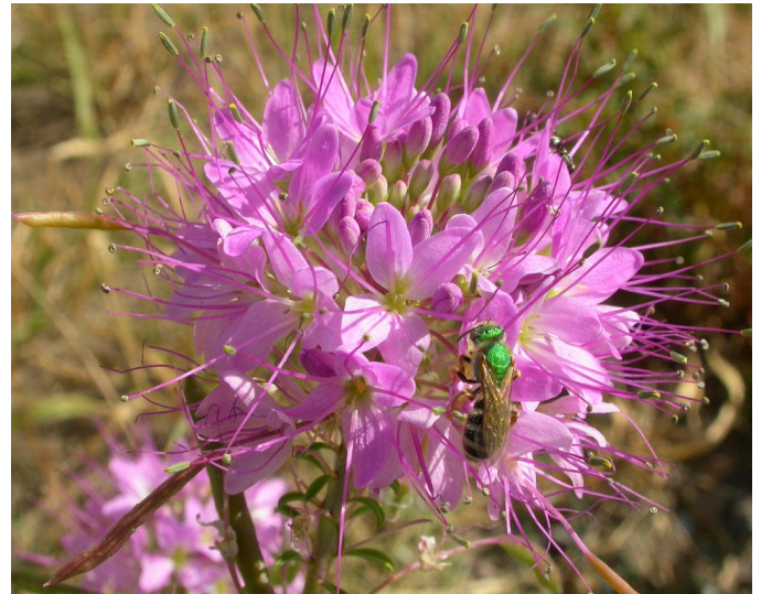
Figure 3. Densely flowered, indeterminate Rocky Mountain beeplant inflorescence with darker colored buds at the apex and flowers and capsules further down the raceme. Note the exerted stamens with green anthers and pink filaments.

Rocky Mountain beeplant produces perfect and pistillate flowers. Perfect flowers have both stamens and a pistil. Staminate flowers begin as perfect buds, but pistil formation is incomplete, thus flowering is not andromonoecious (with staminate and perfect flowers on the same plant) because truly staminate flowers are not produced (Cane 2008). Flowers produce six long, equal, threadlike stamens with purple filaments and green anthers that are exerted as the flower opens (Fig. 4). The pistil of perfect flowers has a basal gland and unilocular ovary with two parietal placentae. The stamens and pistil arise from an androgynophore (stipe) (Blackwell 2006; Vanderpool and Iltis 2010) that is 0.04 to 0.6 inch (1-15 mm) long in fruit (Munz and Keck 1973; Holmgren and Cronquist 2005; Vanderpool and Iltis 2010; Welsh et al. 2015).