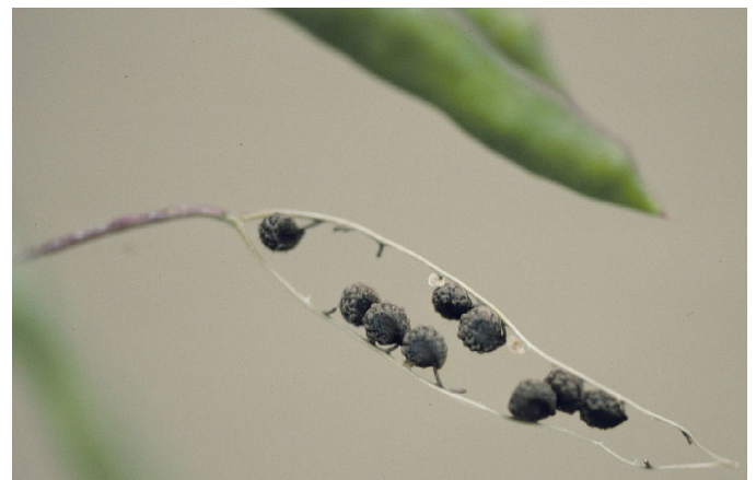
Figure 6. Seeds dispersing from the placenta (replum) after the valves of the capsule have fallen away.

Flowering and fruiting phenology. Rocky Mountain beeplant flowers over a period of several weeks from late spring to mid-summer depending on location. In southern Alberta plants emerge in May, flower buds are produced in June, flowering occurs from June to September, seeds ripen from July to September, and plants die in October (Currah et al. 1983). Flowering begins at the base of the inflorescence and inflorescence branches and proceeds upward as the inflorescence elongates. Thus, older perfect flowers are pollinated, develop capsules, and disperse seed while new flowers continue to develop (Iltis 1958; Munz and Keck 1973; Holmgren and Cronquist 2005). Dehiscence of mature capsules occurs when the two halves (valves) of the capsule separate from the loop-shaped placenta (replum), which remains on the plant and dehisces separately (Fig. 6) (Iltis 1958). Seeds then begin dispersing from the placenta.