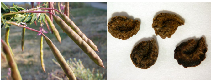
Figure 5. Fruits (capsules) of Rocky Mountain beeplant (left) and horseshoe-shaped seeds with rough surfaces (right).

Iltis (1957) described the beeplants as primitive forms in a reduction series which includes the progressively more specialized genera, Cleomella , Wislizenia , and Oxystylis . He suggested the specializations provided adaptation to progressively more arid environments. Characteristics considered primitive in Cleome