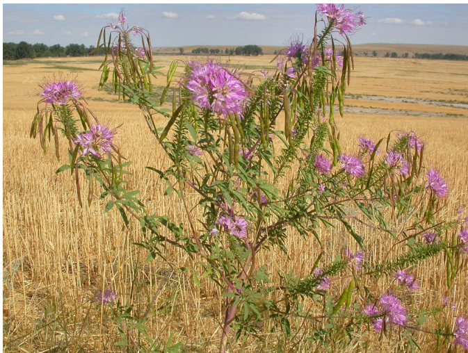
Figure 2. Rocky Mountain beeplant exhibits a rangy growth structure with branches developing from the upper part of the stem, dense inflorescences, and spreading capsules.

Rocky Mountain beeplant is a tall, upright, somewhat malodorous, colonizing annual plant growing 1 to 6.6 feet (0.3-2 m) tall with a 12- to 14-inch (30- to 35-cm) taproot. It produces dense racemes of purple to sometimes white flowers and elongate, spreading pod-like capsules (Fig. 2) (Currah 1983; Cane 2008; Welsh et al. 2015). Plants are erect with glabrous to glabrate stems that may branch above, creating an open, rangy structure. Leaves are alternate, glabrous or with marginal hairs when young, and palmate with three entire to slightly sinuate or serrulate leaflets 0.8 to 2.4 inches (2-6 cm) long and 0.2 to 0.6 inches (0.6-1.5 cm) wide. Leaflets range from lanceolate to elliptic or oblanceolate with mucronate to long acuminate tips (Holmgren and Cronquist 2005; Vanderpool and Iltis 2010; Welsh et al. 2015). Petioles have bristle-like stipules (Vanderpool and Iltis 2010).