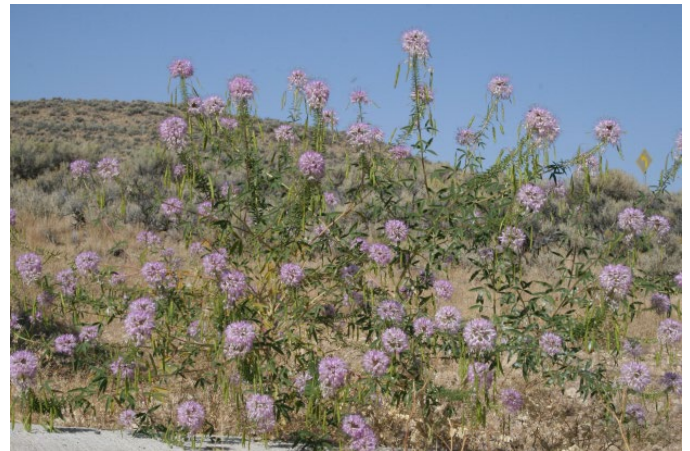
Figure 1. Rocky Mountain beeplant growing in Utah along a roadside (top) and in the Owyhee mountains of Idaho (bottom).

Elevation. Rocky Mountain beeplant grows at elevations from (330) 980 to 8,200 (9,500) feet ([100] 300-2,500 [2,900] m) (Vanderpool and Iltis 2010). It is found at elevations of 2,625 to 9,006 feet (800-2,745 m) in Utah (Welsh et al. 2015), 4,000 to 7,200 feet (1,200-2,200 m) in Wyoming, and 2,500 to 5,200 feet (760-1,585 m) in Montana (Winslow 2014). On the Colorado Plateau, Arizona Mountains and sky Islands, it grows at 4,500 to 7,000 feet (1,400-2,100 m) (The Xerces Society and USDA NRCS 2012).