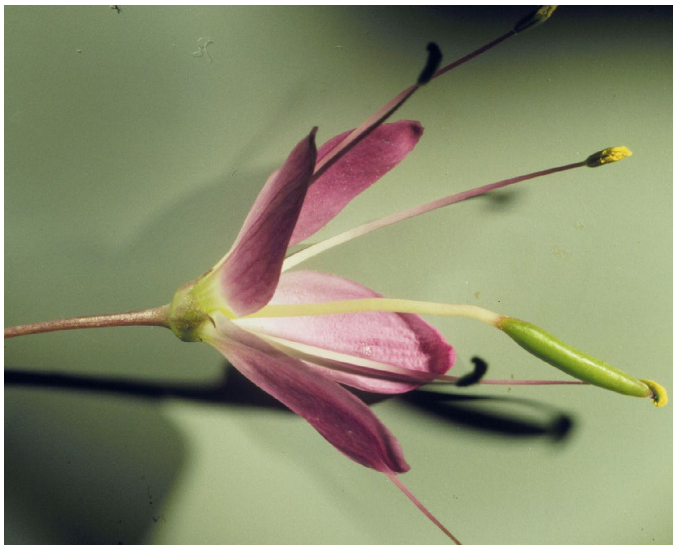
Figure 4. Perfect Rocky Mountain beeplant flower with the capsule beginning to develop.

stipes are more spreading and 0.4 to 0.9 inches (11–23 mm) long with the mature fruits pendulous. Mature viable seeds are 2.8–4 mm x 2.5 to 3 mm, dark brown to black, and spherical to ovoid or horseshoe-shaped with rough surfaces (Fig. 5) (Currah et al. 1983; Holmgren and Cronquist 2005; Vanderpool and Iltis 2010; Winslow 2014). Fruit size variation has been attributed to environmental rather than genetic causes (Iltis 1952 in Vanderpool and Iltis 2010). Seeds reportedly lack or contain only small amounts of endosperm (Iltis 1958; Sanchez-Acebo 2005). The embryo is curved and folded (Iltis 1958). Flowering dates depend on the location, but across the species' range, flowering may occur from May to October (Iltis 1958; Munz and Keck 1973; Holmgren and Cronquist 2005).