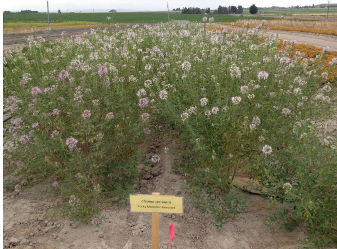
Figure 9. Rocky Mountain beeplant irrigation research plots at the Oregon State University Malheur Experiment Station, Ontario, Oregon.

In 2011 seed yield increased with irrigation up to 8 inches (200 mm) (Table 6), but there was no response to irrigation from 2012 to 2018. Accumulated degree-days were lower than average in 2011, but above average from 2012-2018, suggesting that the lower temperatures favored continued flowering and seed set (Shock et al. 2019).