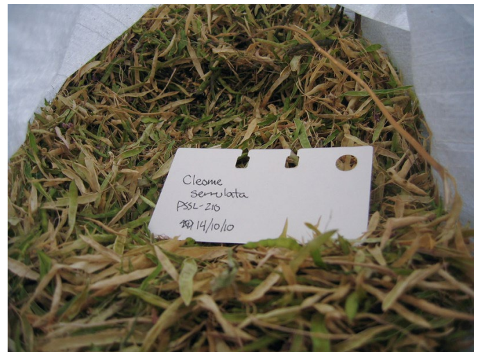
Figure 8. Harvested Rocky Mountain beeplant prior to cleaning consists of capsule valves, seed, and fine debris.

The remaining material is put on a finishing machine. Larger amounts are conditioned on an Office Clipper with a round screen (size 6 to 12 as appropriate) on top to remove stems and pod material and the air is set at 1 to 5 to separate smaller pod pieces and empty seed. If the amount of material is small, the seed is put on a continuous seed blower (CSB) (Mater Seed Equipment, Corvallis, OR) to separate filled seed from the empty seed and remaining pod material. Air is set from 300 to 400 depending on seed size (K. Herriman, USFS Bend Seed Extractory, personal communication, January 2020).