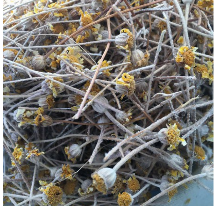
Figure 12. Collection of common woolly sunflower seed heads harvested by clipping stems.

weedy species, particularly those that produce seeds similar in shape and size to those of common woolly sunflower.