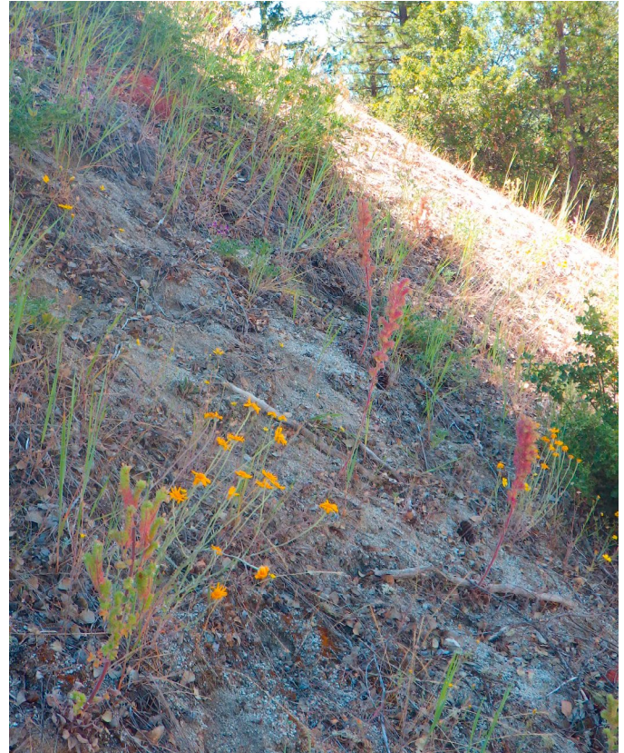
Figure 2. Common woolly sunflower growing in an opening in a mixed-conifer forest in California.

in the understory of Oregon white oak-alderleaf mountain mahogany ( Q. garryana - Cercocarpus montanus ) communities, which are restricted to ridges and rocky rock outcrops (Riegel and Franklin 1992).