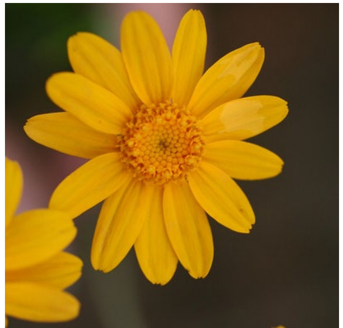
Figure 9. Close up of a single common woolly sunflower flower from a plant growing in California.

The study (Waters et al. 2014) occurred in Puget Trough prairies in western Washington and included nonnative and native species producing similar flowers at a similar time: hairy cat's ear (nonnative), common woolly sunflower (native), and cutleaf silverpuffs ( Microseris laciniata ) (native). Common woolly sunflower was visited by solitary bees and syrphid flies but not eusocial bees. Syrphid flies preferentially visited common woolly sunflower in nonnative neighborhoods ( P < 0.001 ). Visitation rates to common woolly sunflower and hairy cat's ear were higher in exotic neighborhoods. Mean seed set of common woolly sunflower (40-55 seeds/capitulum) was highest in nonnative neighborhoods, which was significantly greater than seed set in clipped nonnative neighborhoods ( P < 0.001 ) and greater, but not significantly so, in native neighborhoods ( P = 0.28 ). Researchers concluded that in nonnative neighborhoods hairy cat's ear reduced the seed set of cutleaf silverpuff while facilitating pollinator visitation and seed set for common woolly sunflower (Waters et al. 2014).