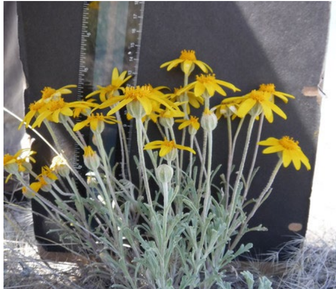
Figure 6. Small-stature common woolly sunflower (<6 inches tall) growing in Idaho.

Variety leucophyllum grows as a long-lived perennial, occurs as clumps, produces massive fibrous roots with abundant root buds, and readily roots from prostrate stems. These plants rarely flower in their first year. Variety achillioides grows as a biennial (or annual) or short-lived perennial, occurs as single individual plants, and produces slight taproots without root buds. These plants often flower in their first year (Mooring 1975, 2008). Varieties are described in more detail in Appendix 1.