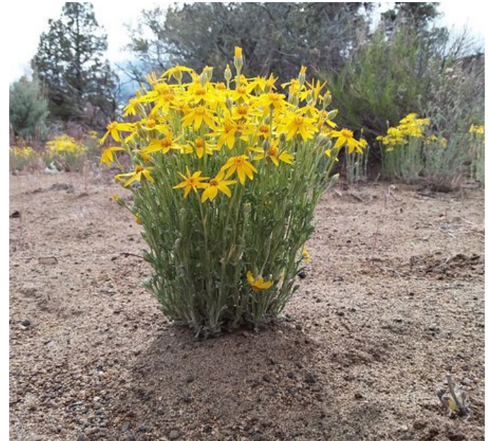
Figure 7. Stout common woolly sunflower plant growing in Oregon.

2006). Disk florets are bisexual and fertile. Both floret types are yellow, but ray flowers are often darker toward the base (Taylor 1992; Johnson and Mooring 2006). Peduncles are 1 to 12 inches (3-30 cm) tall. Involucres are campanulate to hemispheric with almost equal diameter and height (6-15 mm). Bracts are 5 to 15, distinct or connate at the bases and prominently ridged on the back (Munz and Keck 1973; Spellenberg 2001; Johnson and Mooring 2006; Welsh et al. 2016; Hitchcock and Cronquist 2018).