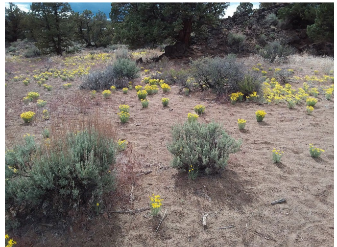
Figure 3. Common woolly sunflower growing in a juniper-sagebrush community in Oregon.

Shrublands. Common woolly sunflower often grows in sagebrush and chaparral communities (Taylor 1992; Stuart et al. 1996). It is also a conspicuous forb in curl-leaf mountain mahogany/