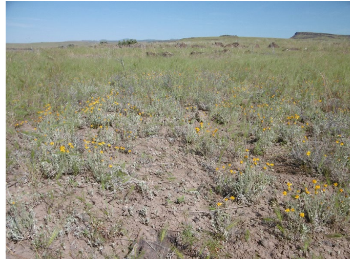
Figure 4. Common woolly sunflower growing in a grassland at King Hill, Elmore County, Idaho. Photo taken in June; BLM ID230 SOS.

as 20% in Idaho fescue-bluebunch wheatgrass-turpentine wavewig ( Pteryxia terebinthina var. foeniculacea ) grasslands in the Blue and Willowa Mountains in Oregon. This vegetation type occurs at 6,040-8,100 feet (1,840-2,470 m) elevation on moderately steep (mean 36%) southwestern slopes (Johnson and Swanson 2005).