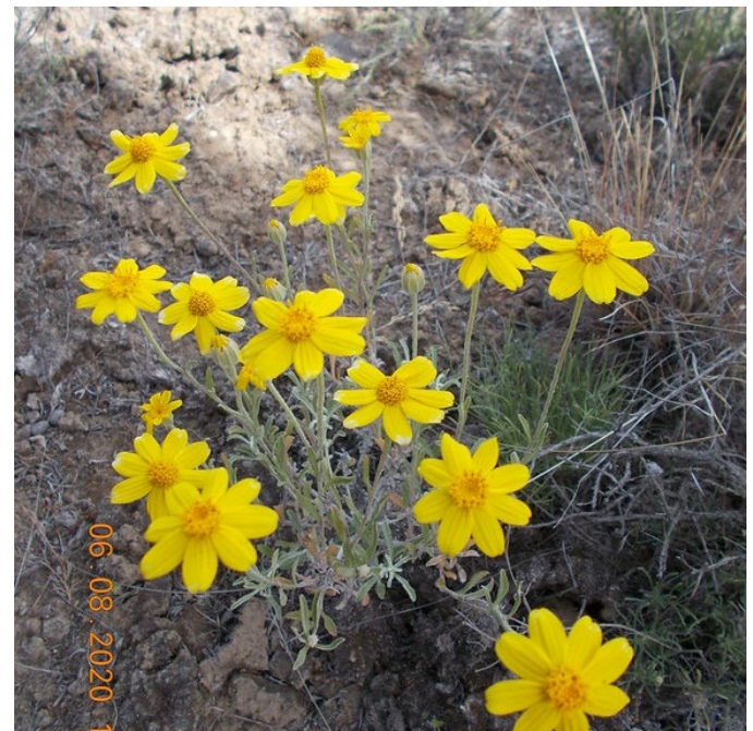
Figure 8. Common woolly sunflower flowers terminal at the ends of stems. Plant growing in Oregon. Photo taken on June 8: BLM OR134C SOS.