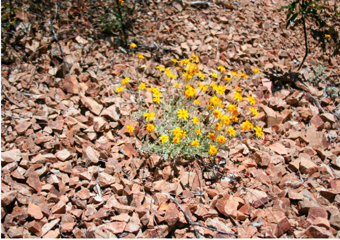
Figure 5. Common woolly sunflower (variety achillioides ) growing at a very rocky site in California. Photo taken in June: BLM CA330 SOS.

Soils. Common woolly sunflower is highly drought tolerant and often grows in dry, sandy to rocky soils (Fig. 5) (Craighead et al. 1963; Chambers 1974; Taylor 1992; LBJWC 2016). It is common in the understory of Oregon white oak-alderleaf mountain mahogany communities in southwestern Oregon, where it is restricted to ridges and rocky outcrops in soils with 47% coarse fragments (Riegel and Franklin 1992).