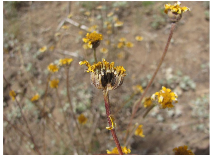
Figure 11. Common woolly sunflower seed head, opened to show individual seeds.

Wildland Seed Collection. Common woolly sunflower plants are easy to identify, seed is retained in the inflorescence longer than for many other Asteraceae, and seed is not wind dispersed (Fig. 11; Skinner 2007; Bartow 2015). Low seed fill often requires large collections be made to meet seed needs (Bartow 2015).