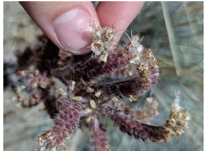
Figure 9. Silverleaf phacelia inflorescence exhibiting indeterminate flowering and seed maturation.

Wildland Seed Collection. Silverleaf phacelia seeds are mature when capsules are dry, and seeds are hard and dark in color. Because flowering is indeterminate (Fig. 9), both mature capsules and flowers or buds may be present at the time of harvest (LeFebvre et al. 2017b). Bristly hairs on the coiled seed head make hand harvesting uncomfortable (Fig. 10) (Winslow 2002).