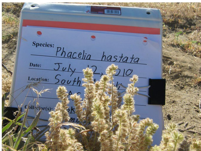
Figure 10. Silverleaf phacelia seed heads covered with bristly hairs.

If wildland-collected seed is to be sold for direct use in ecological restoration projects, collectors must apply for Source-Identified certification prior to making collections. Pre-collection applications and site inspections are handled by the AOSCA member state agency where seed collections will be made (see listings at AOSCA.org).