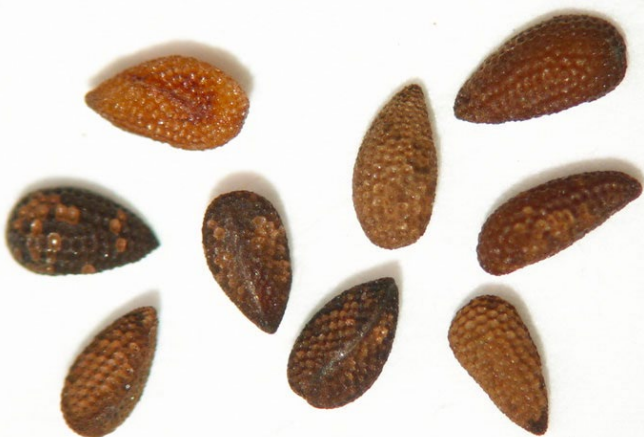
Figure 13. Clean silverleaf phacelia seed.

Seed Cleaning. Small seed size, easily detached flower capsules, and fair seed flow, makes silverleaf phacelia moderately easy to clean (Winslow 2002). Seed is typically cleaned (Fig. 13) by processing it through a hammermill and then a fanning mill (Link 1993; Luna et al. 2008), but more detailed procedures are provided below.