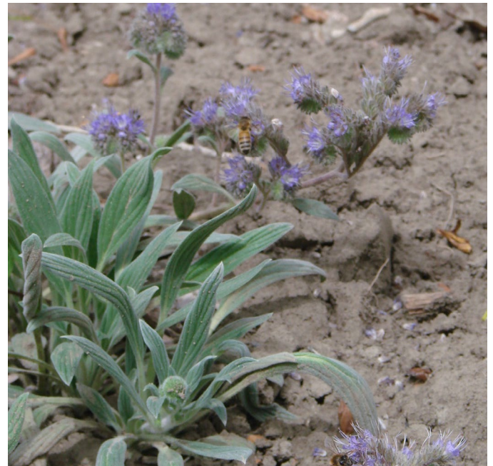
Figure 7. Bee pollinators visiting silverleaf phacelia flowers at the Plant Materials Center in Bridger, MT (2010).

Reproduction. Researchers calculated a fruit/flower percentage average of 65% for 161 silverleaf phacelia plants growing in the Wasatch Mountains near Brighton, Utah (Wiens et al. 1987). Seed/ovule percentages averaged 27% for 21 plants when the preemergent reproductive success (PERS) or the number of viable seeds that enter the ambient environment was evaluated. Average PERS (product of fruit/flower and seed/ovule) for silverleaf phacelia was 18% compared to 22% among all outcrossing species evaluated (Fig. 7) (Wiens et al. 1987).