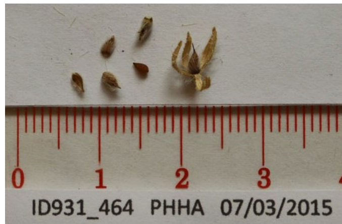
Figure 11. Silverleaf phacelia seeds and a dry capsule containing a seed.

3,615 to 4,407 feet (1,102–1,343 m) in Harney County, Oregon, and the latest was made on August 25 at 3,698 feet (1,127 m) in Boise County, Idaho (USDI SOS 2017). Seed was collected from late July to late September in Montana sites (Winslow 2002; Luna et al. 2008).