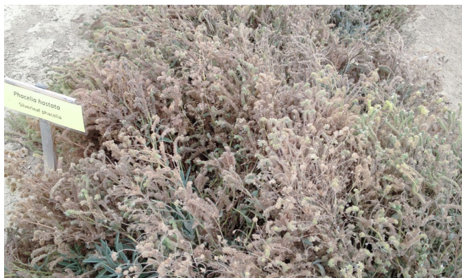
Figure 15. Silverleaf phacelia nearly ready for harvest at Oregon State University’s Malheur Experiment Station in Ontario, OR.

Seed Harvesting. Seed can be hand-harvested or directly combined if maturity across the field is uniform. Seed was often harvested in late June or July at OSU MES (Table 6) and in late July or early August at the Bridger PMC (LeFebvre et al. 2017b). Irrigation and fertilization improved seed production and increased seed head height for improved combine harvests at the Bridger PMC (LeFebvre et al. 2017b). At OSU MES, seed was harvested with a small-plot combine in 2014 and 2015 and manually in 2016 and 2017 when plant heights were low (Fig. 15; Shock et al. 2020).