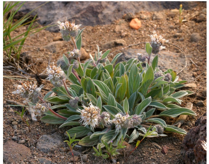
Figure 5. Silverleaf phacelia (variety hastata ) has silvery green foliage. The leaves are lanceolate and petiolate with pointed tips.

Silverleaf phacelia is a short-lived perennial with a stout taproot. Plants have a multi-branched caudex, numerous prostrate to ascending stems, and rarely reach more than 20 inches (50 cm) tall. Stems and leaves are silvery green with fine to stiff, spreading to appressed pubescence, making the hairs almost sticky (Fig. 5) (Munz and Keck 1973; Hickman 1993; Pavek et al. 2012; Welsh et al. 2016; Hitchcock and Cronquist 2018; Luna et al. 2018). Root systems of plants growing on talus slopes in Lassen Volcanic National Park, California, grew upslope from the caudex because soil shifting pushed the aboveground plant material away from the roots. For 10 silverleaf phacelia plants on these slopes, the root/shoot biomass averaged 0.63. Root length averaged 10.8 inches (27.5 cm) and depth averaged 8.6 inches (21.8 cm) (Pérez 2012).