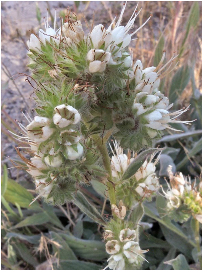
Figure 6. Silverleaf phacelia inflorescence with helicoid cyme of small, crowded, white flowers with long exserted stamens, Oregon State University's Malheur Experiment Station (2018).

Silverleaf phacelia produces many tight- to open-coiled cyme inflorescences (helicoid cymes) with small white to lavender or purple flowers (Fig. 6) (Blackwell 2006; Pavek et al. 2012; Welsh et al. 2016; Hitchcock and Cronquist 2018). Inflorescences are terminal and simple to branched with flowers along most of the flowering stalk length (Munz and Keck 1973; Blackwell 2006; Luna et al. 2018). Individual flowers are subsessile with urn to bell-shaped, tubular corollas 4 to 7 mm long with five spreading lobes (Munz and Keck 1973; Hickman 1993; Luna et al. 2018). The five stamens extend beyond the spreading corolla lobes by more than 2 mm. Styles are 7 to 10 mm long and deeply divided (Hickman 1993; Welsh et al. 2016; Luna et al. 2018). Silverleaf phacelia produces dry, stiff, ovoid, 2 to 4 mm long capsules with stiff hairs (Hickman 1993; Welsh et al. 2016; Luna et al. 2018). Capsules are two-chambered and typically contain one to three seeds (Hickman 1993; LeFebvre et al. 2017b). Seeds measure 1.5 to 2.6 mm long, and have pits in vertical rows (Hickman 1993; Welsh et al. 2016).