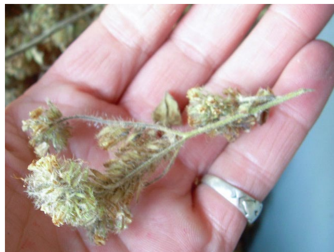
Figure 12. Clipped silverleaf phacelia seed head.

Collection methods. Seed can be collected by hand stripping or by clipping filled seed heads (Fig. 12) (Luna et al. 2008; Bujak and Dougher 2017). Hands should be protected when collecting silverleaf phacelia seed (Winslow 2002). Bristly hairs on the seed heads contain an irritating oil that can cause rashes and itching that lasts several days (LeFebvre et al. 2017b).