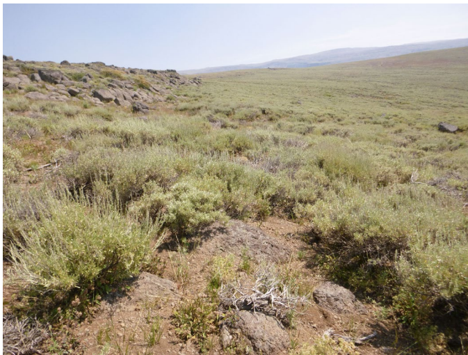
Figure 2. Silverleaf phacelia in a sagebrush community in Oregon.

and support greater vegetation cover (Day and Wright 1985). In the White Mountains of California, silverleaf phacelia occurs in alpine vegetation on south- and east-facing slopes below 13,000 feet (4,000 m) (Mitchell et al. 1966). Dominant shrubs and subshrubs are wax current ( Ribes cereum ), granite prickly phlox ( Linanthus pungens ), Nuttall's linanthus ( Leptosiphon nuttallii ), little sagebrush ( A. arbuscula ), and timberline sagebrush ( A. rothrockii ). Climate in the White Mountains is cold and semi-arid with an average annual precipitation of 15.5 inches (394 mm) and temperature of 28 °F (-2 °C) (Mitchell et al. 1966). In Clark and Nye counties of Nevada, silverleaf phacelia is associated with sagebrush/pinyon-juniper, big sagebrush-curl-leaf mountain mahogany ( Cercocarpus ledifolius ), and ponderosa pine ( Pinus ponderosa ) communities occurring at elevations of 6,000 to 8,500 feet (1,800–2,600 m) (Beatley 1976).