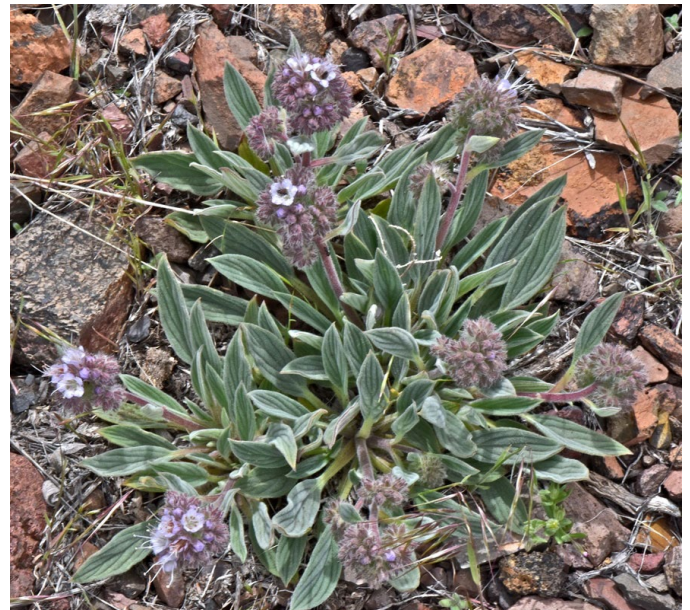
Figure 4. Silverleaf phacelia (variety compacta ) growing in rocky soils in California.

Soils. Silverleaf phacelia commonly occurs on a variety of dry, coarse-textured soils (Fig. 4) (Taylor 1992; Link 1993; Lambert 2005; Blackwell 2006; Pérez 2012). It is also found on disturbed soils from the foothills to above timberline (LeFebvre 2014).