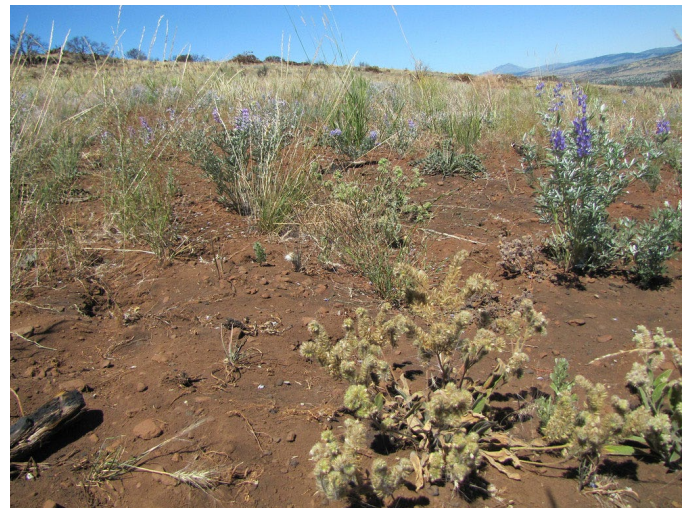
Figure 1. Silverleaf phacelia in a California grassland.

exposures where silverleaf phacelia is much less common (Blinn 1966). In montane grasslands on the east side of Rocky Mountain National Park, Colorado, silverleaf phacelia only occurred in plots not invaded by sweetclover ( Melilotus officinalis ). Montane grasslands occupy well-drained soils and are dominated by mountain muhly ( Muhlenbergia montana ), blue grama ( Bouteloua gracilis ), and needle and thread ( Hesperostipa comata subsp. comata ) (Wolf et al. 2004). Silverleaf phacelia is abundant in talus and scree communities above tree line (10,249 feet [3,124 m]) on Mt. Washburn in northcentral Yellowstone National Park. Spreading wheatgrass ( Elymus scribneri ) dominates talus and scree communities, where the frost-free season averages 93 days, and precipitation is less than 32 inches (800 mm)/year (Aho and Bala 2012).