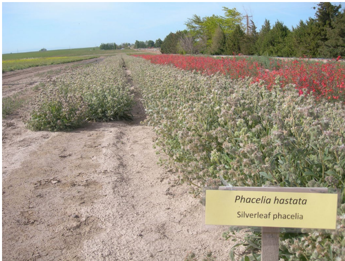
Figure 14. Silverleaf phacelia seed production plots growing at Oregon State University’s Malheur Experiment Station in Ontario, OR.

averages ranged from 34.3 to 153 lbs/acre (38.4–171 kg/ha) and increased with irrigation in most years (Shock et al. 2018).