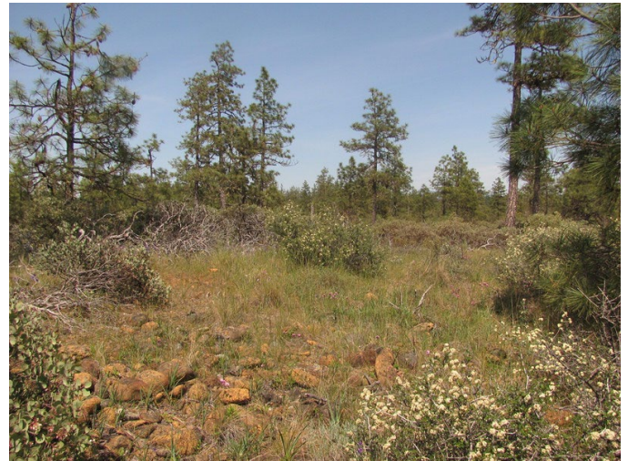
Figure 3. Silverleaf phacelia conifer habitat in Oregon.

Woodlands/Forests. Silverleaf phacelia can be found in a variety of montane woodland and forest types. It grows in western juniper ( J. occidentalis ) woodlands in the Steens Mountain of southeastern Oregon dominated by 80-year-old trees and 24% overstory canopy cover (Bates et al. 2000). In central Oregon's pumice region, silverleaf phacelia is associated with ponderosa pine forests (Busse et al. 2009). Silverleaf phacelia occasionally occurs in exceptionally well-drained, shrub-free pumice sand flats in Jeffrey pine ( P. jeffreyi ) forests on Glass Mountain, Mono County, California (Horner 2001). In the South Warner Mountains in southeastern California, silverleaf phacelia grows in several forest types found on western and northwestern slopes including white fir/sweetcicely ( Abies concolor/Osmorhiza berteroi ), white fir/tailcup lupine ( Lupinus caudatus ), and white fir/whiteveined wintergreen ( Pyrola picta ) forests (Riegel et al. 1990).